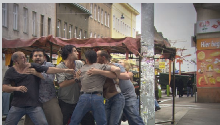
Mark Lewis, The Fight , 2008, single screen projection, 5 mn 27 s, HD video, film still courtesy Monte Clark Gallery (Vancouver)/Clark & Faria (Toronto)/galerie serge le borgne (Paris).

The constellation of temporary exhibitions, national representations, and thematic exhibitions that take over Venice for the first week of June every other year is usually a grand affair that defies any type of human scale. Surprisingly, that was largely untrue this year. Perhaps as a side effect of the slowing world economy, the majority of artworks and exhibitions seemed less glittery and over the top. This new-found seriousness at the Venice Biennale ultimately allowed a good number of interesting, intelligent, and compelling artworks to stand out without reverting to the shock-and-awe treatment of previous years. Within the realm of photography and video-based art, three artists' works are particularly worth a second look: those of Mark Lewis (Canada), Atta Kim (Korea), and Fiona Tan (Holland). Though each is quite different in content, all shared a simplistic and somewhat subdued approach that successfully embodied very powerful artistic voices.