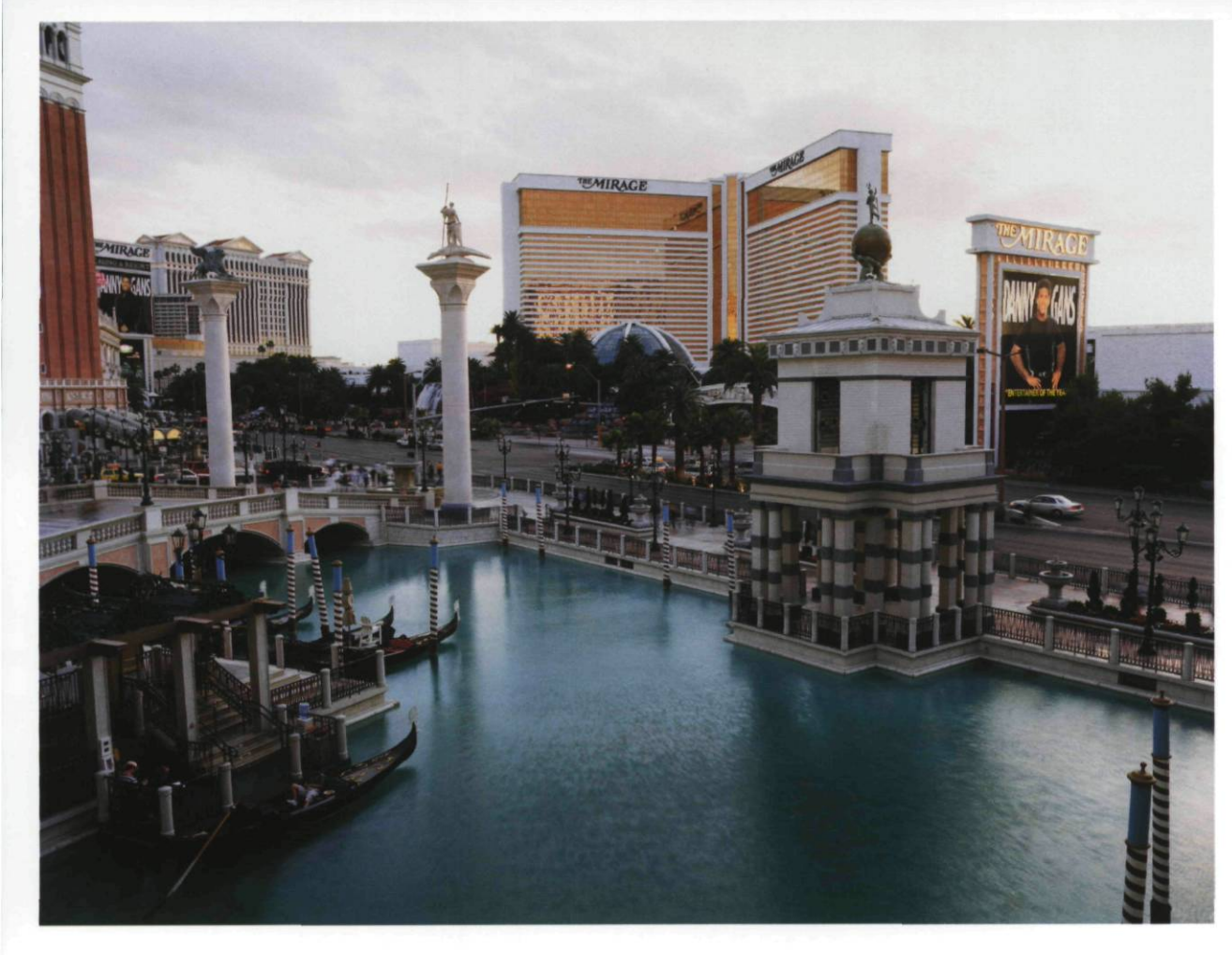
Inca Trail, Peru, 2005 101,6 x 132,1 cm Icefields Parkway, Alberta, 2006 121,9 x 152,4 cm

Las Vegas, Nevada, 2004 121,9 x 152,4 cm