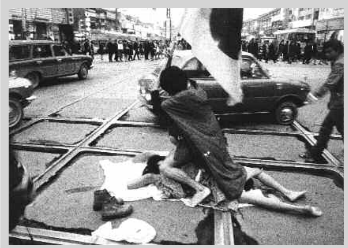
Minoru Hirata, A Happening on the Street, 1970 (Collective Kumo at the Tenji Intersection of Fukuoka, February 26, 1970), photo: courtesy of Taka Ishii Gallery, Tokyo