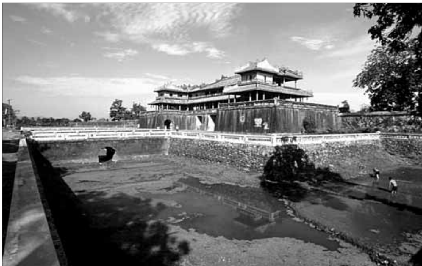
Imperial City, Southern Gate, main entrance to the palace, Vietnamese architecture, Vietnam.

Privately-owned companies (PCs) are often small-sized, family-run types of businesses; however, PCs with multiple owners can be very large. The term joint-ventures (JCs) describes a joint-invested company between a domestic company and international corporation. These companies are often large and have strong financial resources provided by foreign partners. The term equitized is perhaps customized to indicate a special type of ownership in Vietnam. State-owned companies that were in danger of bankruptcy were allowed to be equitized, meaning that they could sell up to 49% of their shares to private investors. By equitizing, the state maintains control of the company while increasing its funding from other sources. Equitized companies (ECs) are often medium or large size. Because of the difference in ownership and thus in management style, Vietnamese tourism companies may have a very different attitude towards voluntary participation in sustainable tourism programs.