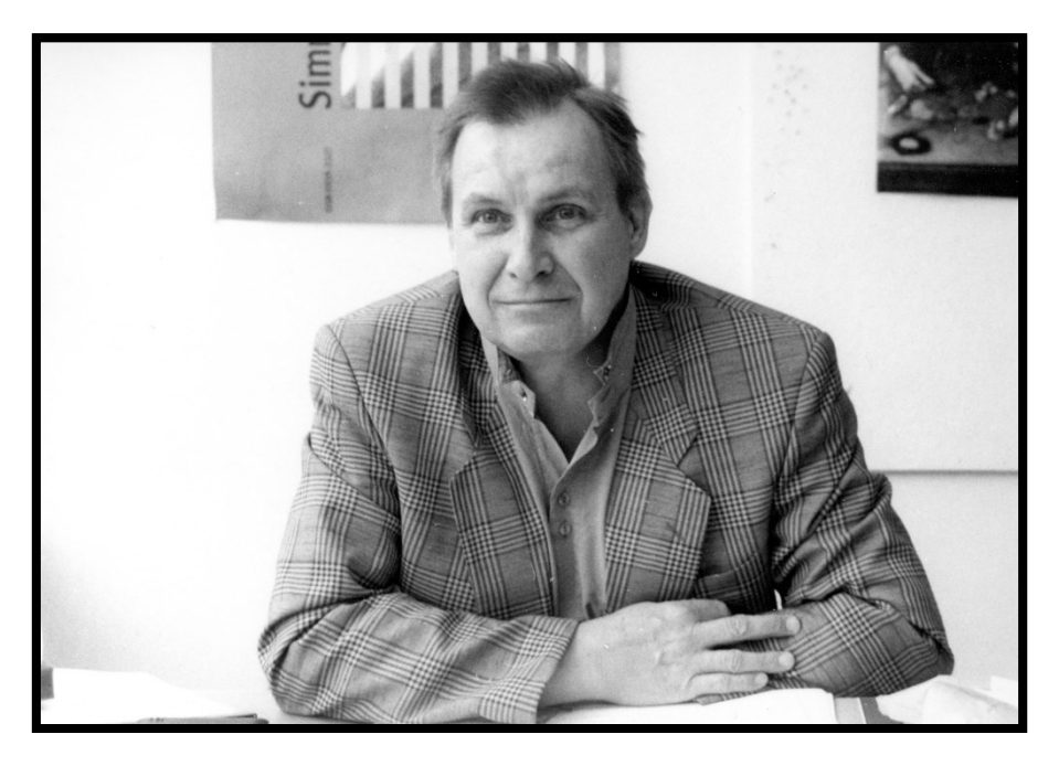
Rammstedt 1993.