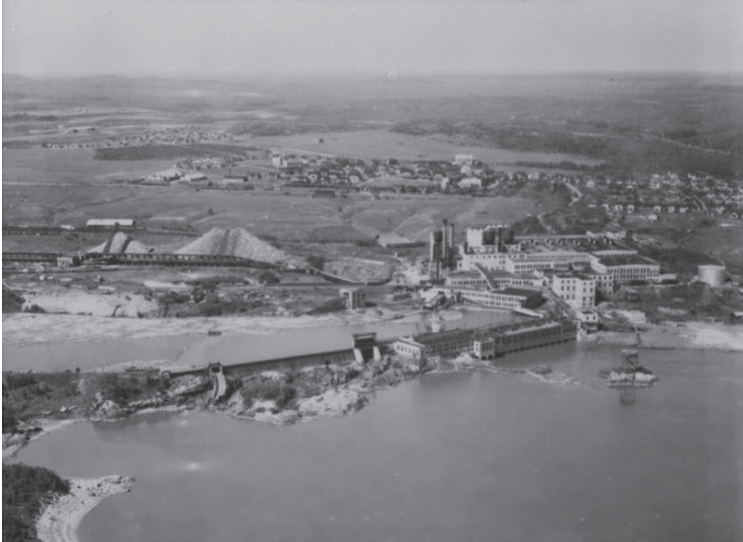
Figure 4. Hydro-electric facilities Iroquois Falls on Abitibi River.

upper limit of hydropower potential, its capacity (or load) ran up against the promises of a political economy predicated on unlimited economic growth, even with the capacity of regional electric grids to interconnect and shift the load. As energy requirements grew beyond what could be provided by hydro generating stations, the state had to scale back, ignore, or alter its claims about energy abundance. One of the ways energy producers and governments grappled with these challenges was, according to Mitchell, through “produced scarcity.” During the early years of any new form of energy, a surplus exists for which suppliers must manufacture demand through the “rapid construction of lifestyles ... organised around the consumption of extraordinary quantities of energy.” 44 In Ontario, the business interests and monopolies that built the first private hydropower plants at Niagara followed this approach. 45 Ontario Hydro, which had assumed control of most of these private generating stations in the first decades of the twentieth century, did the same. In order to increase demand for electricity, the public utility sold inexpensive appliances on installment plans and even gave them away.