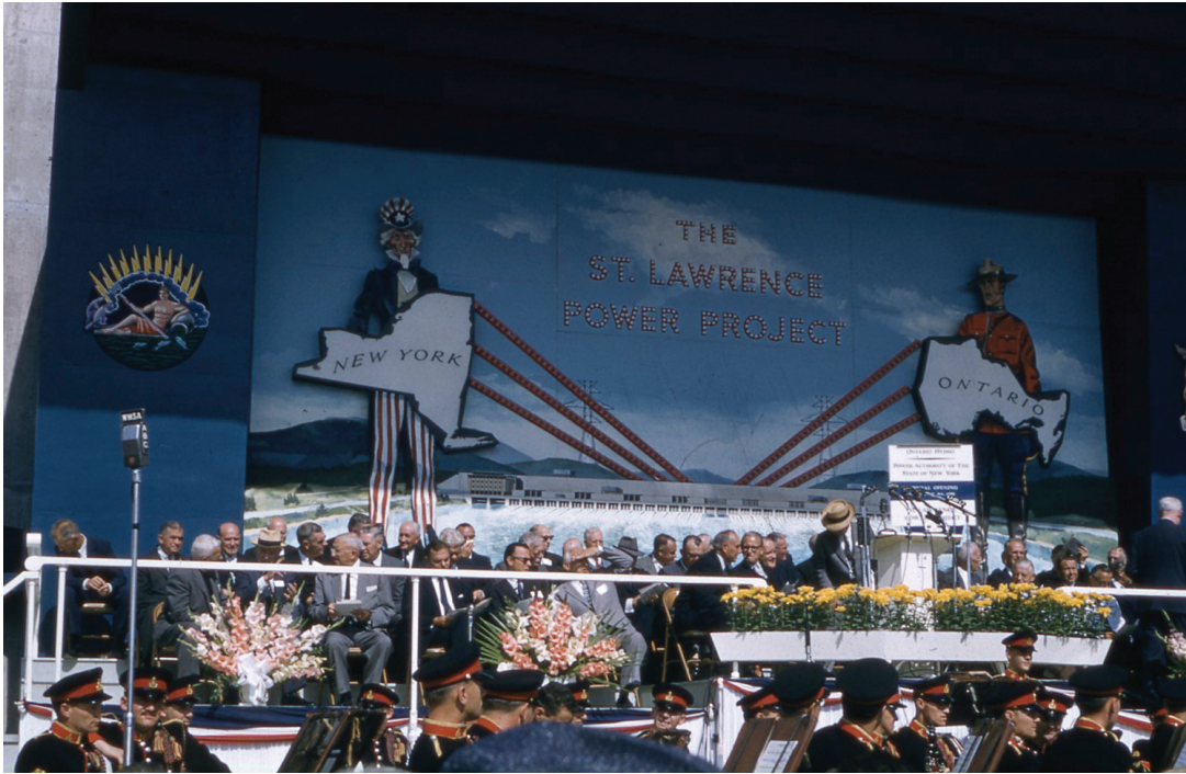
Figure 3. Opening Ceremonies for St. Lawrence Power Project. Ontario Power Generation.

cooperative development of border waters for power and navigation. 36 Decades of jurisdictional wrangling over the development of navigable waters shaped federal politics. Until the 1940s, when constitutional settlements clarified the issues, power developments often instigated federal-provincial tensions, such as the negotiations over dam sites on the Ottawa River. 37 The joint development of major hydro-electric installations—such as those located on the Niagara and St. Lawrence Rivers—required extensive international negotiations and diplomatic treaties and agreements. Sometimes these negotiations flared into major diplomatic disputes, though hydro-electricity ultimately did more to create long-term cooperation and integration than it did conflict. 38