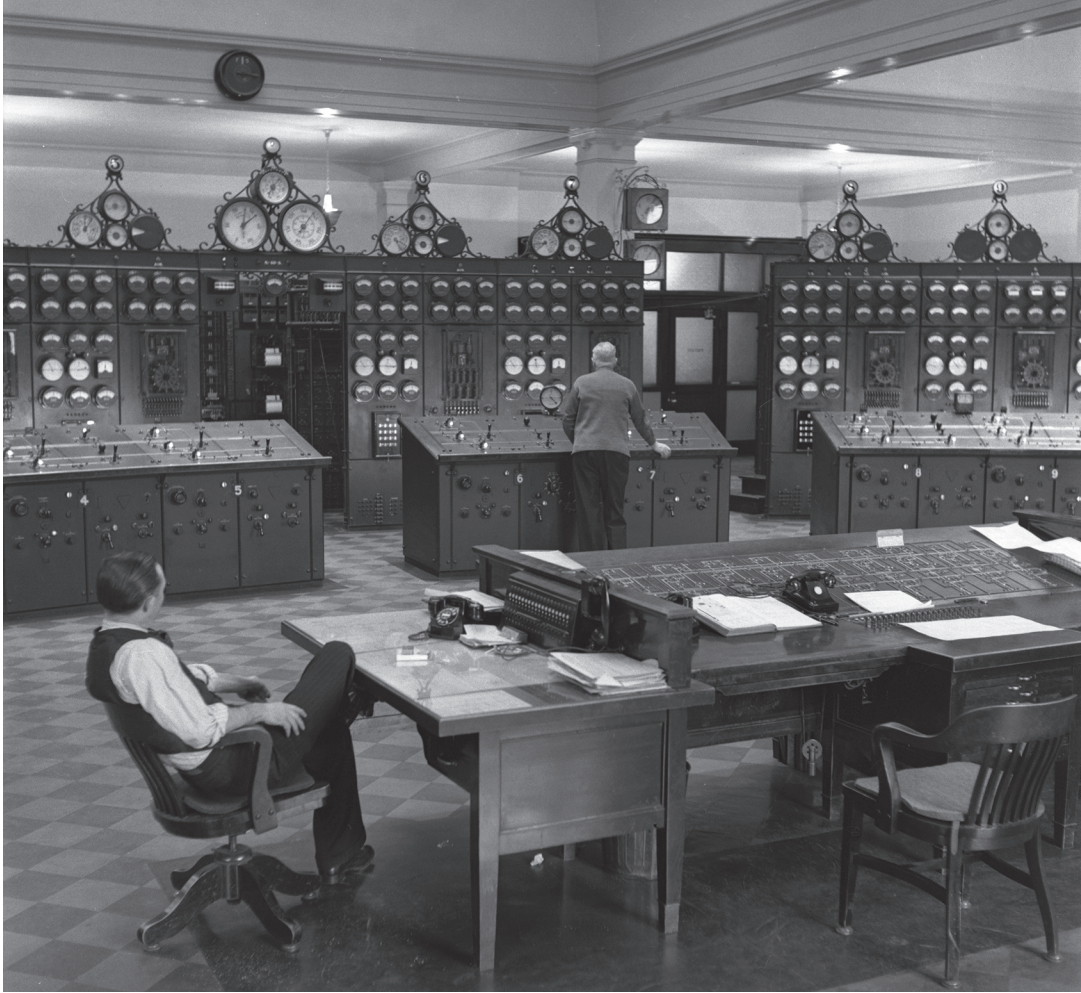
Figure 2. Control room of the Queenston hydro-electric plant.

At the end of the nineteenth century, hydropower seemed almost limitless. Falling water was treated as inexhaustible, because the technology had not yet advanced to the point where hydro stations could fully exploit the head of water at places like Niagara Falls. Moreover, this “white coal” burned clean compared to coal, oil, or biomass. Once the public adopted the attitude that hydro energy was infinite, both energy producers and governments used the material abundance of energy to lend legitimacy to a suite of policies that claimed to offer greater opportunities to its citizens, while simultaneously obscuring the inequitable division of the benefits of that abundance. Hydropower’s material bounty enabled the state to act as the benefactor, distributing electricity for use in an almost endless number of applications—even though most hydropower users in the first half of the twentieth century were a small group of industries and manufacturers. 30 In the process, these abundant applications led people to frame hydro-electricity as indispensable energy for a constantly growing number of Canadians and thus a feature of modern democratic society.