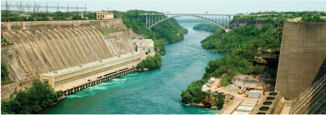
Figure 5: Sir Adam Beck Generating Stations at Niagara Falls.

than did hydro-electricity. When controlled by a public utility, coal and nuclear power also became matters of political and democratic debate. But even as governments used abundant hydropower to claim to represent the interests of a widening segment of Ontario society, the physical infrastructure that embodied hydro's socio-political potential transformed a wide variety of distant communities and environments. In the places where envirotechnical systems converted falling water into hydro-electric energy, abundance could work against democracy. In many Canadian provinces, public utilities came to exercise a monopoly, or near-monopoly, on large-scale hydro-electric development. Unlike coal, but quite similar to oil, hydropower deployed and distributed expertise to take autonomy out of the hands of labour. 46 Planning and executing hydro developments required specially educated and elite hydraulic engineers, and once completed, such developments required only a handful of people to operate. Such a small coterie of operators, owners, investors, technocrats, and government officials formed "hydraulic bureaucracies" that functioned as special interest groups, even as they professed to be representing the public will and interest. 47