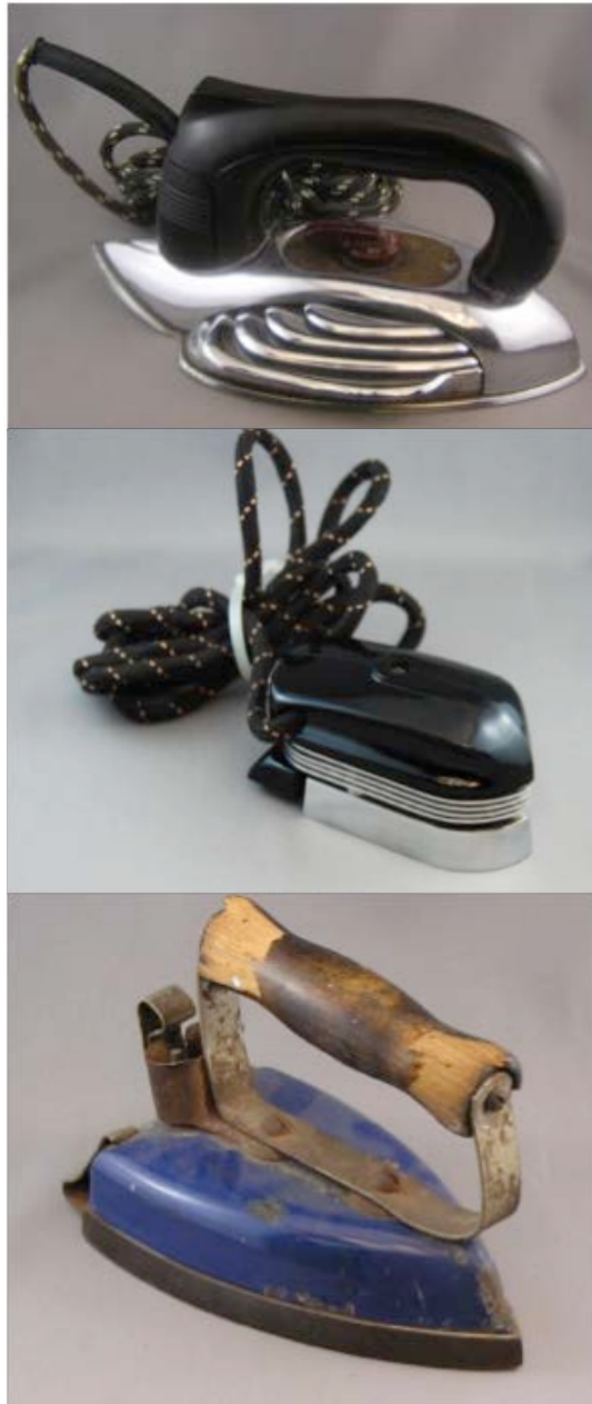
Figure 1. Waverly Tool Company's 1941 Petitpoint W410, Vancouver Engineering Works Limited's 1945 Nepro Midget 33, and Renfrew Electric Products Limited's 1925 Majestic Por-cel-iron 88