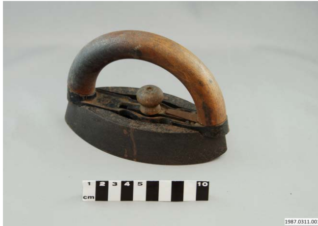
Figure 3. James Smart Manufacturing Company 1880 Black Painted Iron