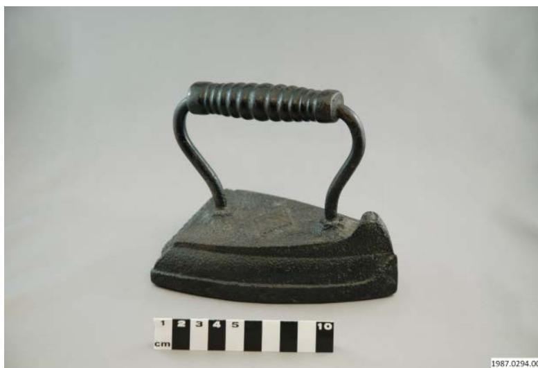
Figure 2. Unknown Manufacturer 1894 G Iron