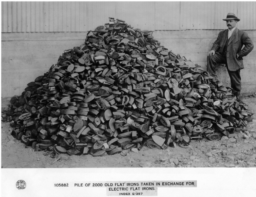
Figure 6: To promote the use of electricity, the General Electric Company gave away 2,000 electric irons in exchange for sad irons.