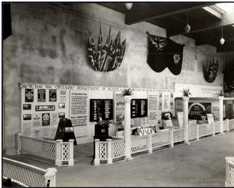
Figure 8. Untitled, 1926.