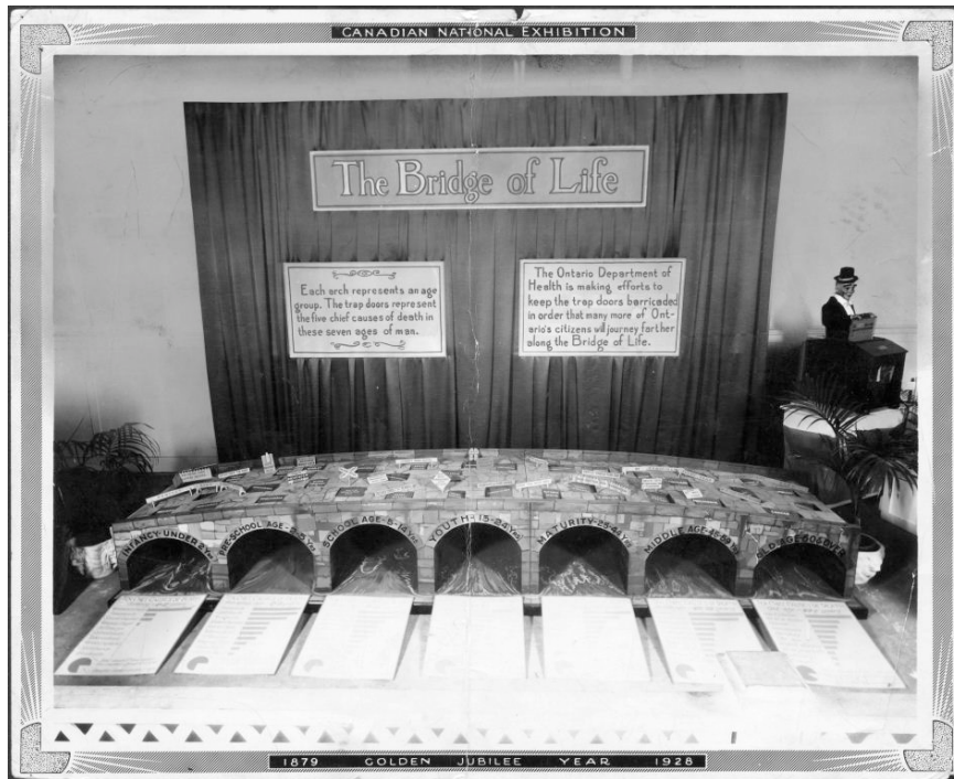
Figure 1. “The Bridge of Life,” 1928.