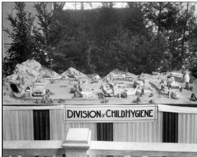
Figure 5. "Division of Child Hygiene Exhibit – Canadian National Exhibition," 1926.