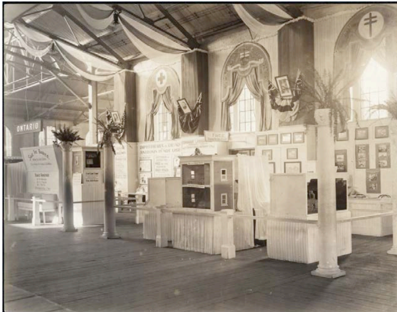
Figure 10. "General View of Health Exhibit at Canadian National Exhibition," 1918.