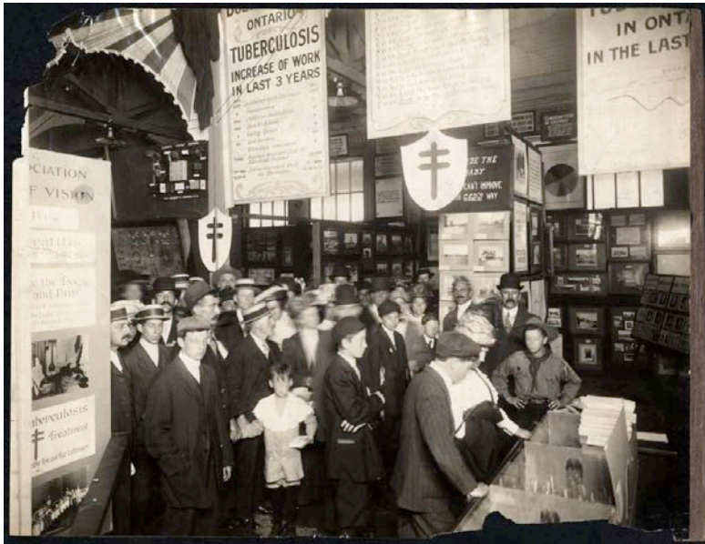
Figure 7. "Old Gas Building," 1911.