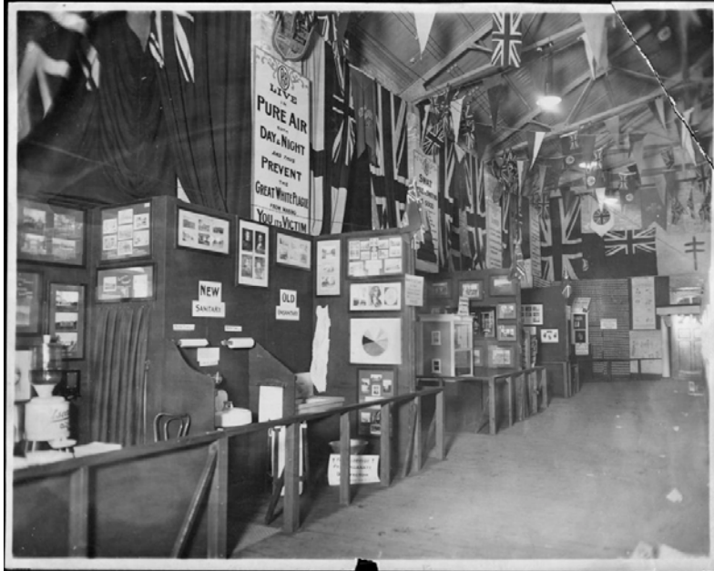
Figure 9. “Public Health Display – Dominion Cart Building” 1912.