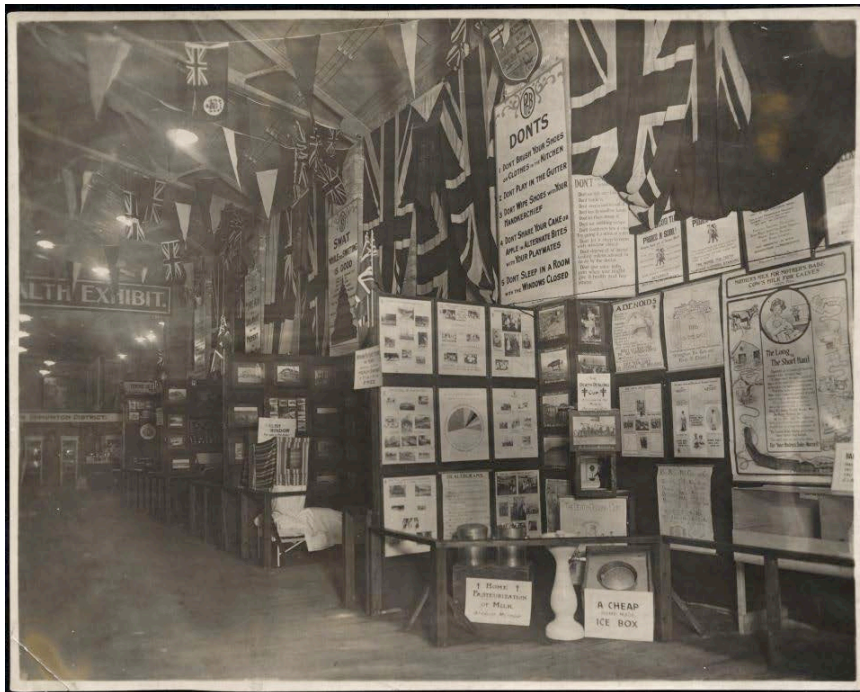
Figure 2. “Health Exhibit, 1912.”