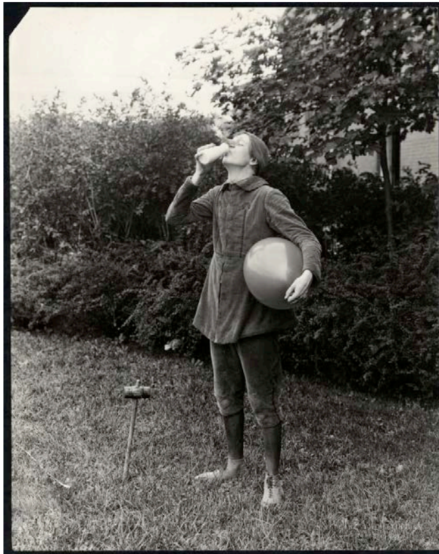
Figure 3. “‘Happy’ the Health Clown,” 1921.