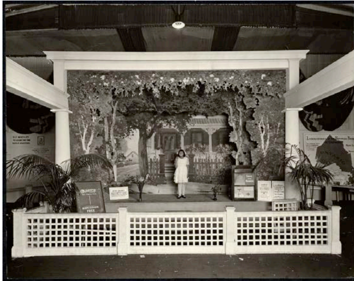
Figure 4. "Stage," 1921.