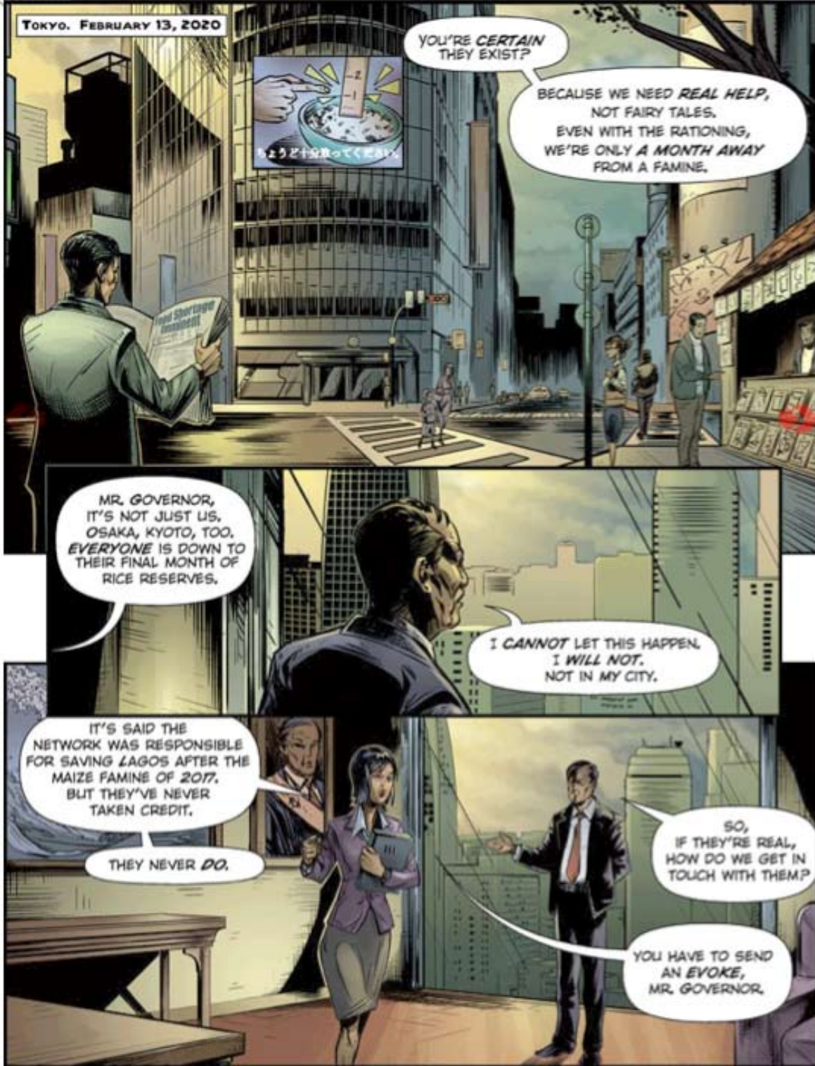
Figure 2: Evoke Comic Panel, Episode 1, Page 1

Episode 001: The earth moves at different speeds depending on who you are. – Nigerian proverb