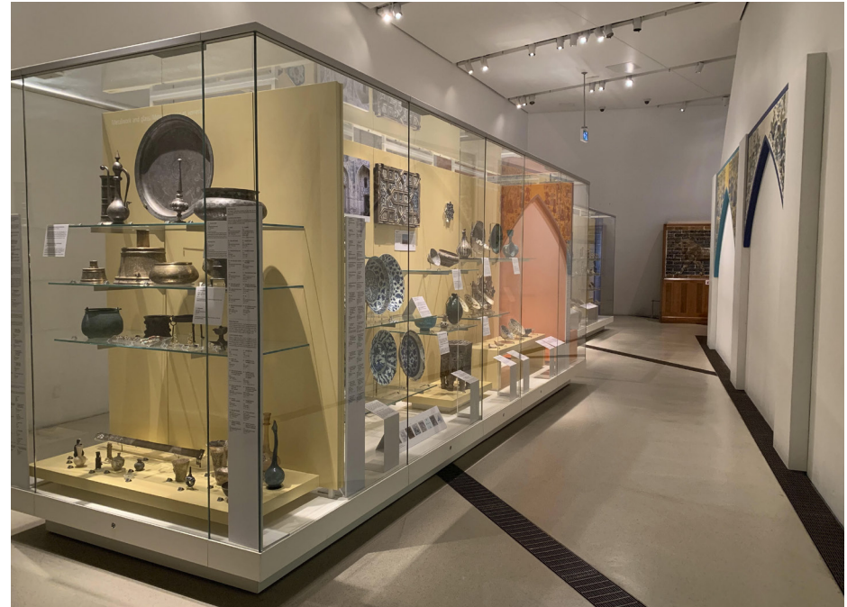
Fig. 2. The “Hymns and Talismans” display with a mix of artefacts from vastly different eras. Note the lack of contrast between the sand-coloured artefacts against the light yellow display panel and the numerous shadows cast by the objects in poorly lit conditions.