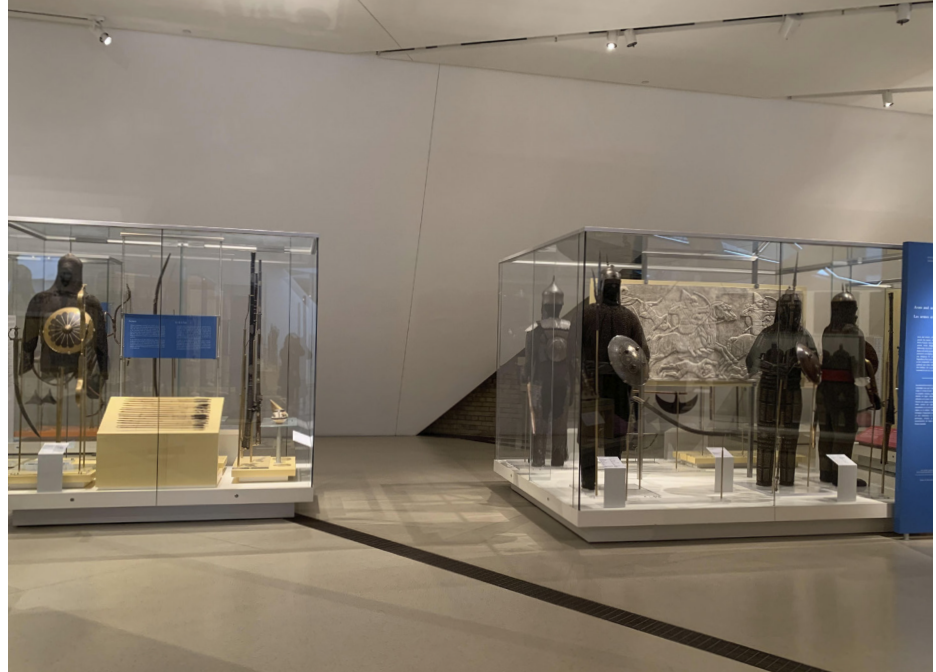
Fig. 4. The “Arms and Armour” and “Archery” cases with full size mannequins are prominent displays in the Wirth Gallery.

Furthermore, the current gallery already includes objects from regions outside the Middle East, including North Africa and Central Asia. The ROM holds Canada's largest collection of artefacts from the Islamic world, with around 10,000 objects spanning six curatorial areas: Islamic World; Global Africa; Global South Asia; China; Europe; and Global Fashion and Textiles. Additionally, many museum staff are cross-appointed as professors at UofT and other institutions of higher learning, enabling them to teach and provide students with hands-on learning opportunities using the ROM's rich collections and to continue generating world class research and publications in the fields of Islamic art, archaeology, architecture, and ethnography. The time is ripe to reconceptualize the current gallery and offer more inclusive and engaging experiences for our diverse audiences. ◀