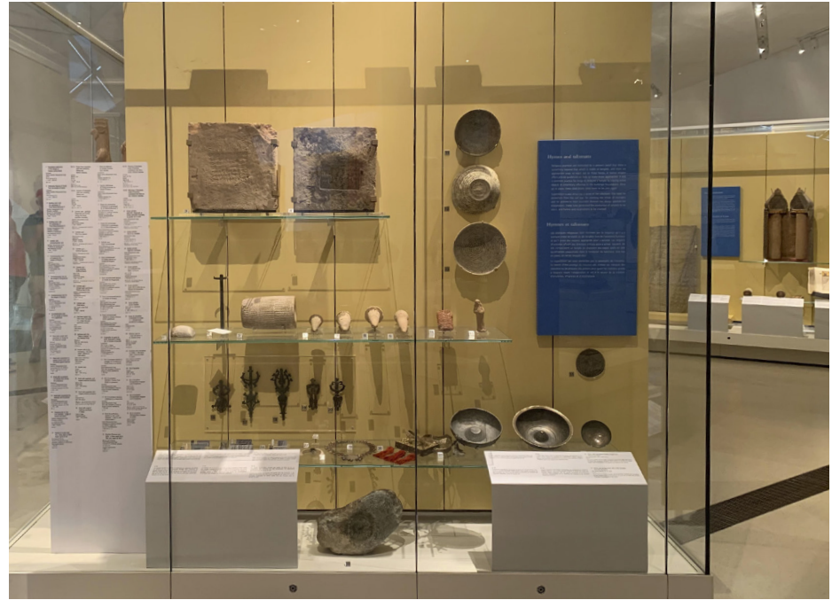
Fig. 3. The hidden “corridor-extension” has some of the ROM’s greatest treasures, including the Safavid tile arches, glazed ceramics, and the Babylonian lion frieze tucked in a corner of the gallery.

A gallery of the Middle East or the Islamic world? Although the term “Islamic world” may not be ideal when describing the multi-ethnic and multi-religious cultures of the countries within a vast area that spans West Africa to Southeast Asia today, I still prefer conceptualising a gallery of the Islamic world rather than one limited to the Middle East. The combination of ancient and medieval material in the Wirth Gallery of the Middle East is fraught with issues.