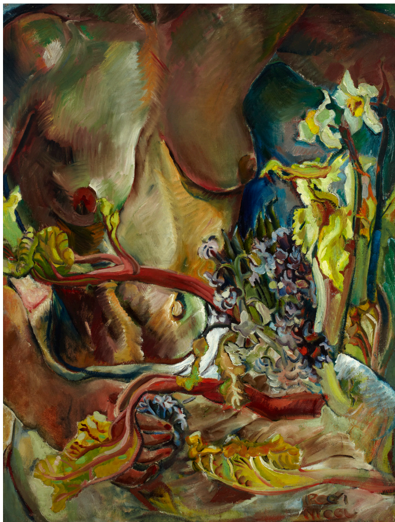
Figure 5. Pegi Nicol MacLeod, Torso and Plants , ca. 1935. Oil on canvas, 90.9 × 68.7 cm. Robert McLaughlin Gallery.