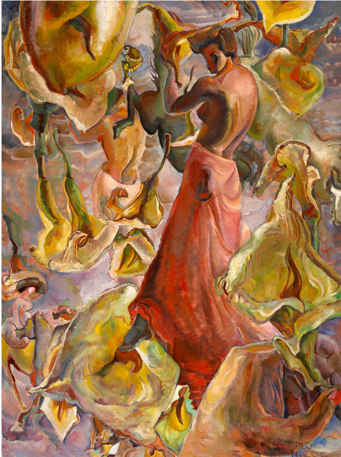
Figure 4. Pegi Nicol MacLeod, A Descent of Lilies , 1935. Oil on canvas, 122 × 91.6 cm. National Gallery of Canada, Ottawa. Purchased 1993.