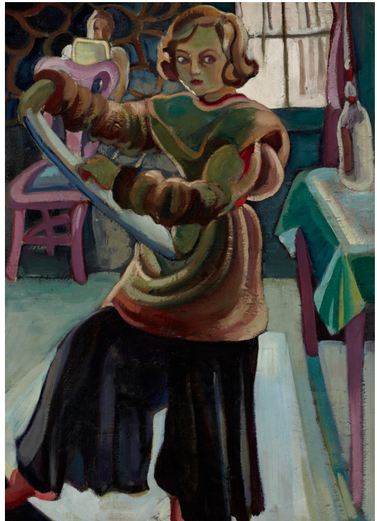
Figure 3. Pegi Nicol MacLeod, Costume for a Cold Studio (Self-Portrait) , ca. 1930. Oil on canvas, 43.1 x 38.1 cm. Robert McLaughlin Gallery.