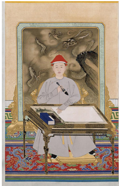
Figure 4. Anonymous Court Artist, Portrait of the Kangxi Emperor in Informal Dress Holding a Brush, Hanging Scroll, 1662–1722, Beijing, The Palace Museum.