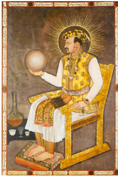
Figure 7. Abu 'l-Hasan or Dawlat (?), Portrait of Jahangir, first half of the seventeenth century. Private Collection.