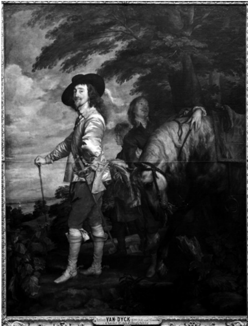
Figure 12. Anthony van Dyck, Charles I at the Hunt , ca. 1635. Oil on canvas. Paris, Louvre.

in front of his baldachin bed, on a carpet slightly elevated on a platform, where the ambassador has been admitted because he represents the Pope. Moreover, a balustrade provides a physical obstacle separating the King and the Ambassador from the crowd of attendants. Even if mixed in slightly different order, these are the elements of interior materiality that appear in Kircher's print.