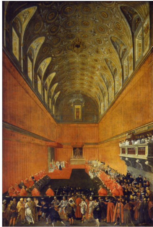
Figure 10. Agostino Tassi, Appointment of Taddeo Barberini as Prefetto of Rome, 1631–1633. Oil on Canvas. Rome, Museo di Roma, MR 5700.