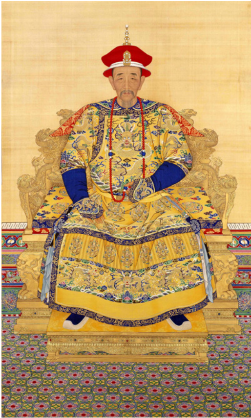
Figure 13. Anonymous Qing Dynasty Court Painter, Portrait of the Kangxi Emperor in Court Dress , late Kangxi period. Hanging scroll, colour on silk. Beijing, The Palace Museum.