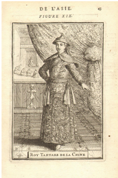
Figure 3. Anonymous, The Kangxi Emperor, 1683. Engraving. From Alain Manesson Mallet, Description de l'Univers.