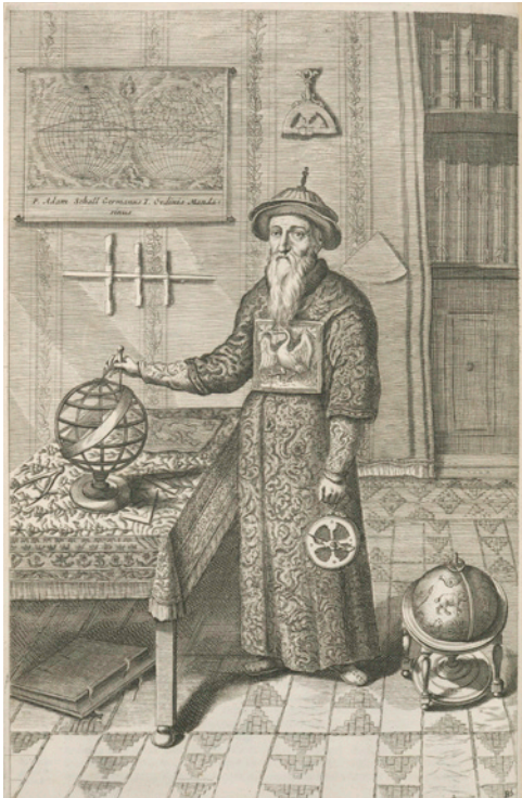
Figure 15. Anonymous, Johann Adam Schall von Bell, 1667. Engraving. From Athanasius Kircher, China Illustrata.