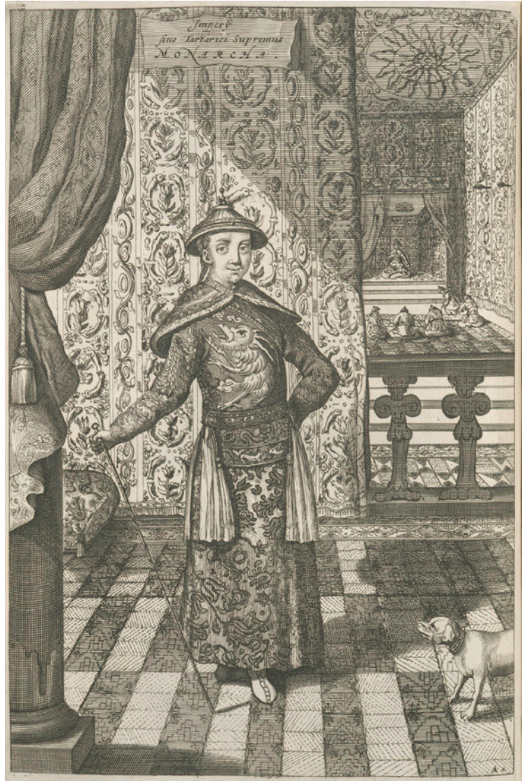
Figure 1. Anonymous, The Kangxi Emperor , 1667. Engraving. From Athanasius Kircher, China Illustrata .