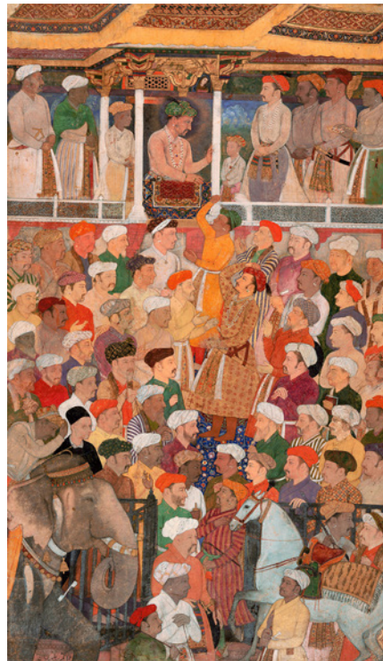
Figure 8. Manohar and Abu'l Hasan (attributed to), Darbar of Jahangir , ca. 1620–1624. Ink, opaque watercolor and gold on paper, 35 × 20 cm. Boston Museum of Fine Arts.