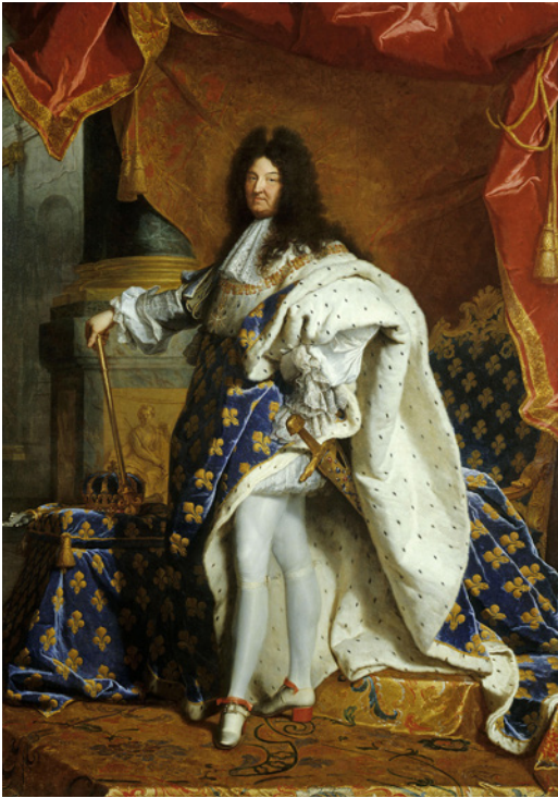
Figure 9. Hyacinthe Rigaud, Portrait of Louis XIV , 1701. Oil on Canvas. Paris, Louvre.