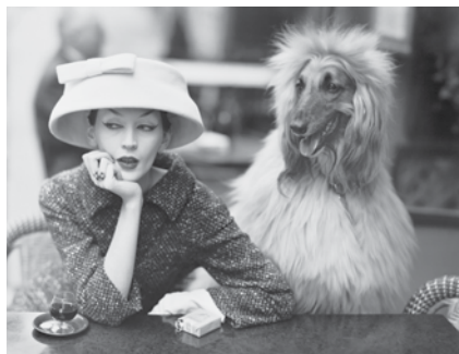
Dovima with Sacha, cloche and suit by Balenciaga, Café Les Deux Magots, Paris, 1955.