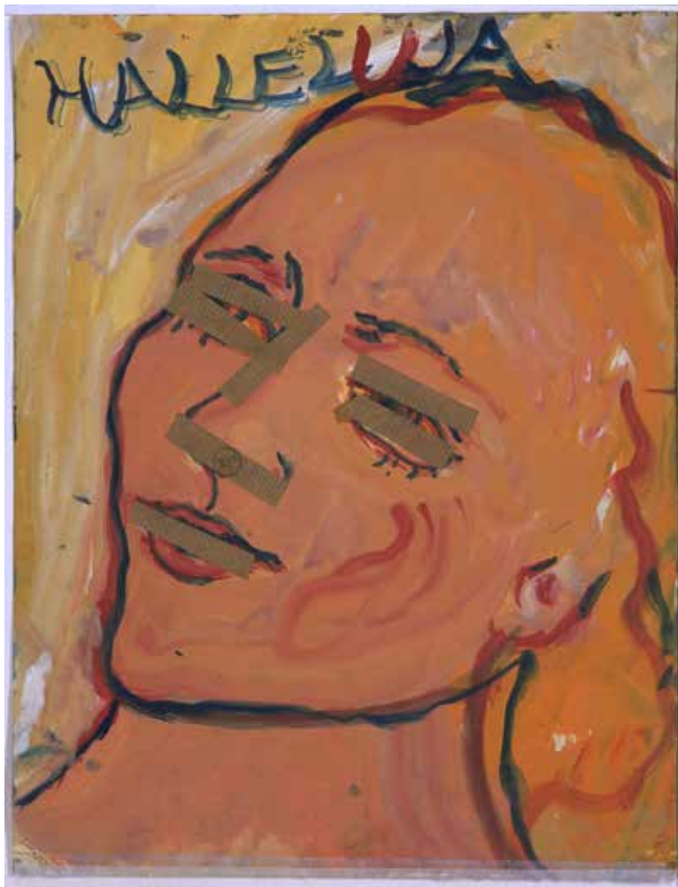
Figure 1. Charlotte Salomon, Paulinka Bimbam singing Halleluja. Excluded and defaced painting.

supplementary logic of their relations. This involved imagining when each was made. I think the Main Part (the work has three elements: a prologue, a main part, and an epilogue)—which has the majority of paintings CS later found supplementary, that is, that could be sacrificed to create the epilogue for instance—was the core of the project and hours were spent by the artist detailing every conversation and reflection of the two characters Amadeus Daberlohn and Paulinka Bimbam . I did discover that there were thematic or analytical relations between the works selected to be turned over and those re-used in another part of the project. So, it is as if there is a hidden commentary, a silent joke, a witty addition, if we could lay them all out. Yet the fact of having to turn a painting over, of creating two-sided images, is itself fascinating, as we ponder how she imagined a reader and why she placed certain images on the reverse. This is what made me choose for my cover an image of the avatar of the painter— Charlotte Kann —sitting with a ringed binder of a manuscript, with her tools beside her, planning on turning words into paintings, ideas into images.