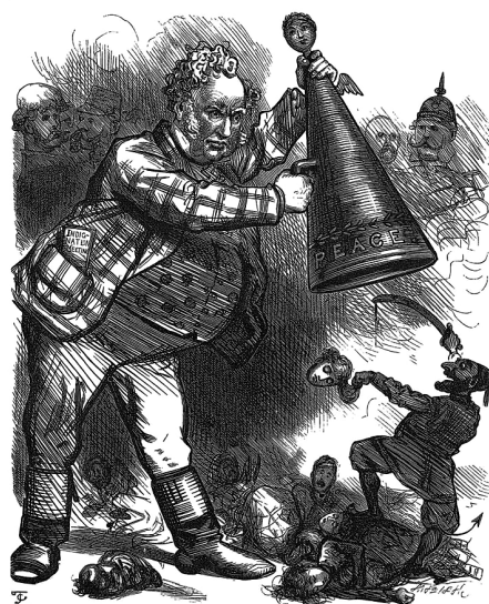
"BRAVO, JOHN!" THE ONLY RESPECTABLE WAY OF MENDING THE MATTER.