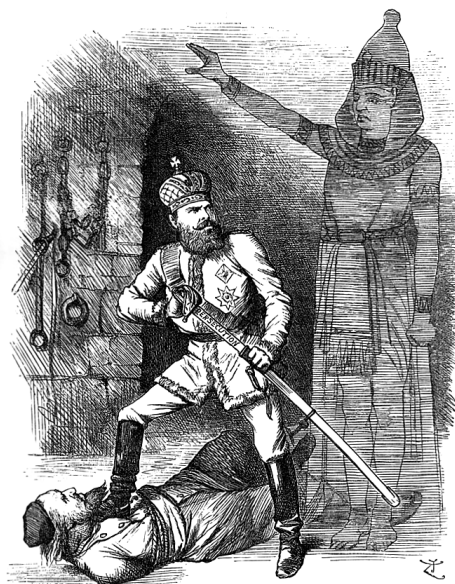
FROM THE NILE TO THE NEVA.

BRAND OF PHARAOH. "FORBEAR! THAT WEAPON ALWAYS WOUNDS THE HAND THAT WIELDS IT."