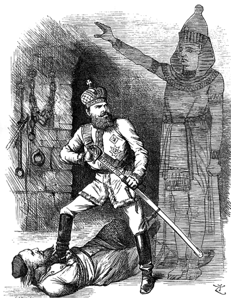
FROM THE NILE TO THE NEVA.

BRAND OF PHARAOH. "FORBEAR! THAT WEAPON ALWAYS WOUNDS THE HAND THAT WIELDS IT."