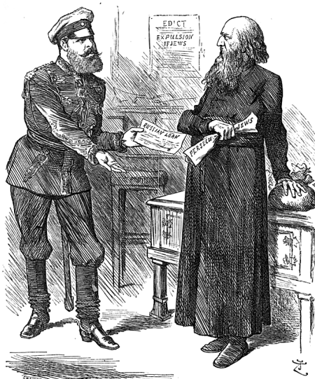
"BLOOD" VERSUS "BULLION."

"WELL THEN, IT NOW APPEARS YOU NEED MY HELP: YOU THAT DID VOID YOUR URINUM UPON MY BEARD, AND FOOT ME, AS YOU SPURN A STRANGER CUR OVER YOUR THRESHOLD: MONKEYS IS YOUR GIFT. WHAT SHOULD I SAY TO YOU?"— Merchant of Venice , Act I, Sc. 3.