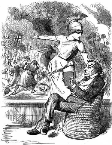
NEUTRALITY UNDER DIFFICULTIES.

DIZZY. "Bulgarian Atrocities! I can't find them in the 'Official Reports'!!!"