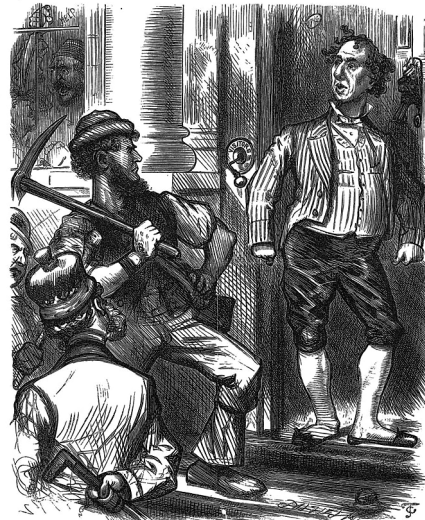
ENGLAND'S PRIDE AND GLORY.

DIZZY. "Bulgarian Atrocities! I can't find them in the 'Official Reports'!!!"