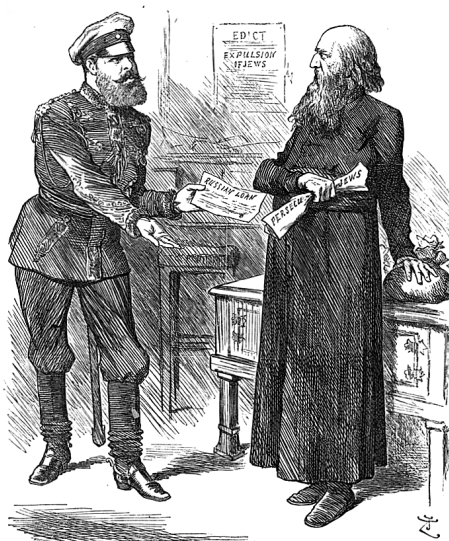
Figure 10 (right). John Tenniel, The Alarmed Autocrat , in Punch , June 13, 1891. Private collection.