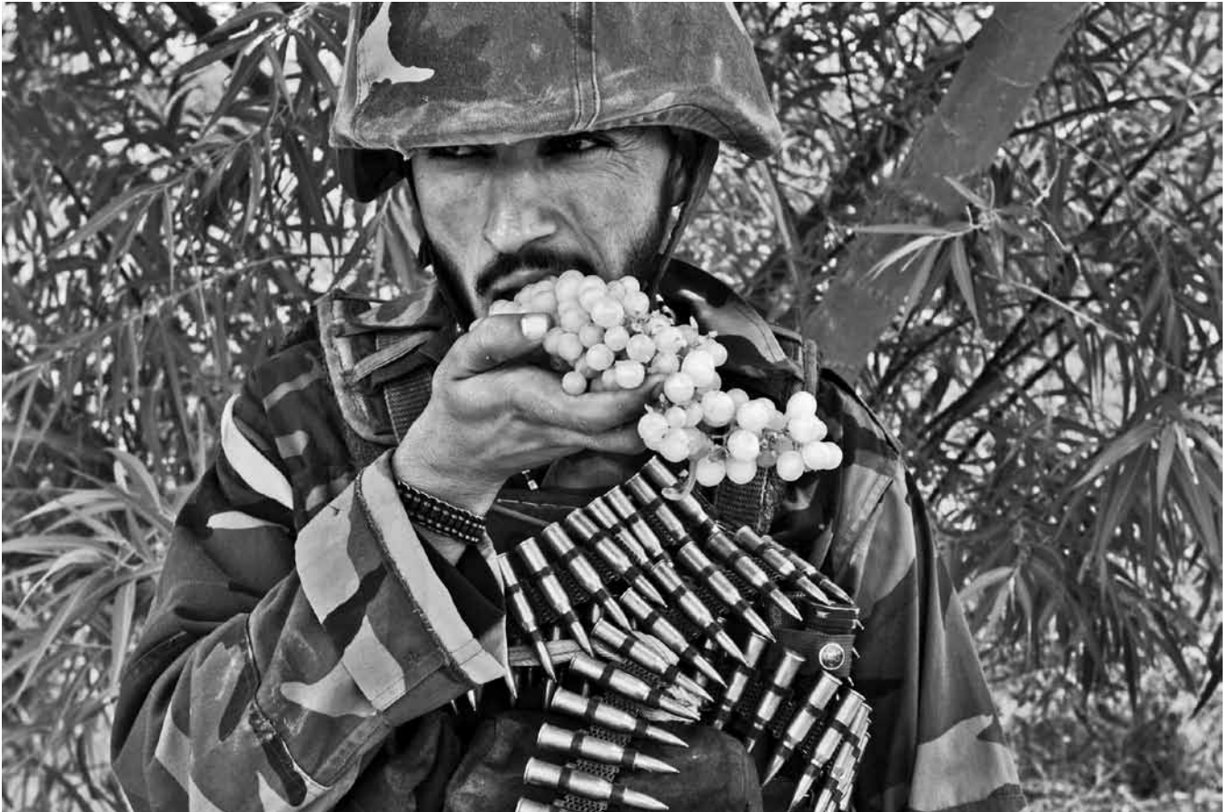
Figure 2. Louie Palu, An Afghan soldier eats grapes during a patrol in Pashmul in Zhari District, Kandahar Province, Afghanistan, 2008. Archival digital print.