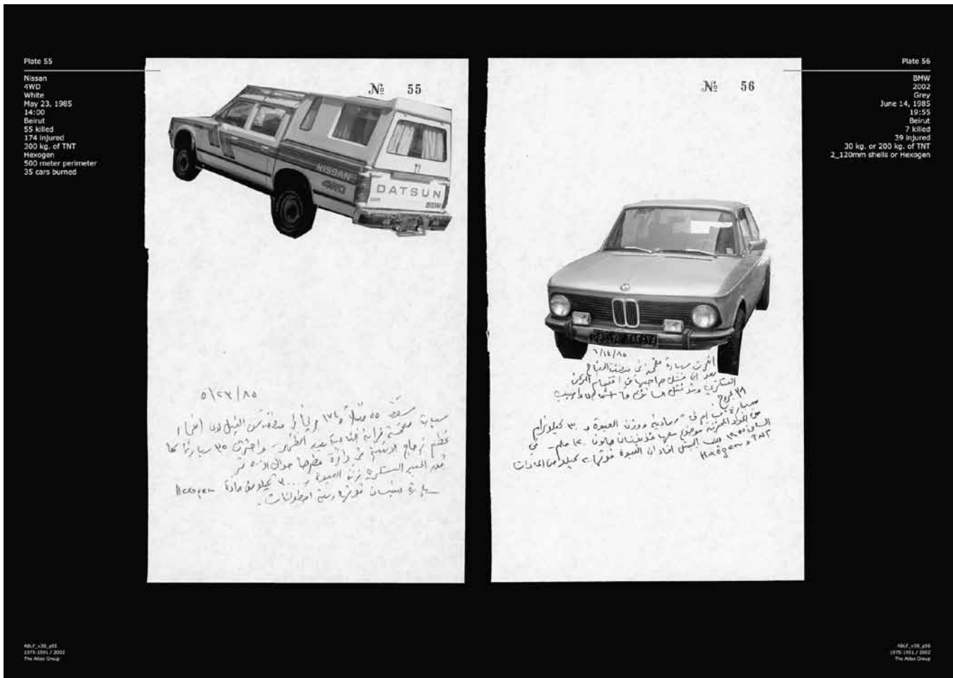
Figure 2. Walid Raad, Notebook 38, Already Been in a Lake on Fire , plates 55 and 56, 1991/2001, from the Fakhouri file, Atlas Group Project .

Furthermore, the accompanying statistics “speak” to a documentary discourse of facts. The photograph acts as a stand-in for both the exploded car and its facticity. It works as a sort of quasi-truth where the statistical data of a real exploded car bomb are combined with a photograph of a stand-in copy. This becomes a double substitution: a photograph of a substituted car and the history of the Lebanese wars replaced by the “facticity” of an exploded car. Despite the fact that this document is about a car bomb, there is no depiction of the explosion, of death, of blood, or of any trace of the trauma of war. A question arises: how can statistics accurately represent a graphically violent act? The ambiguous veracity of the notebook implies that while photographs and statistics are believed to represent objective facts, their supposed neutrality is often notoriously easy to manipulate to reflect different points of view.