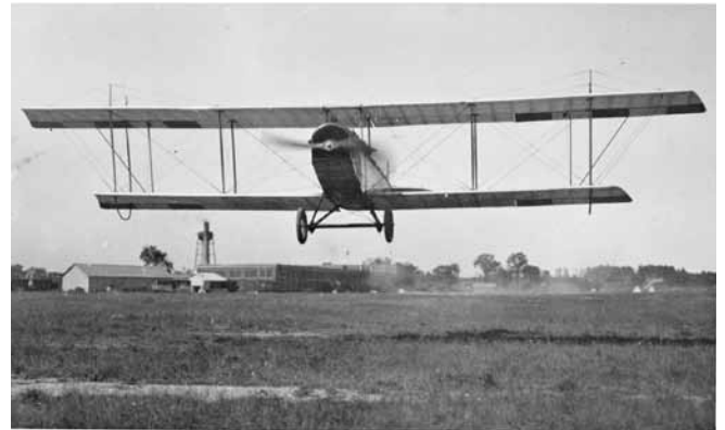
Figure 12. Bi-plane

Lismer and Johnston's photographic sources are now archived. However, the finding aid for Johnston's material produced in 1998 by LAC covers textual material only. Upon last enquiry (2012), the photographs had not yet been catalogued. A number of explanations can be offered. First, the photographs are not Johnston's. Indeed, no authorship or provenance can be assigned to any of them. Second, although at least two exter-