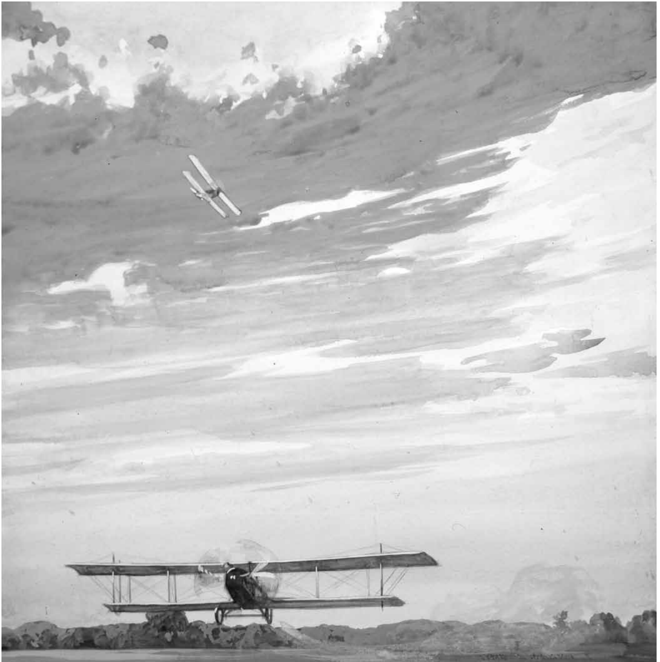
Figure 11. Frank Johnston, Taking Off , 1918, watercolour and gouache on art board, 37.4 x 37.3 cm, Canadian War Museum, Beaverbrook Collection of War Art, 19710261-0298.