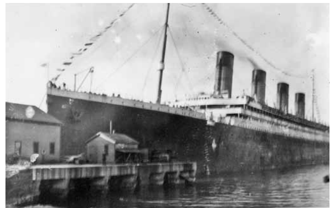
Figure 8. Arthur Lismer, The R.M.S. Olympic Moored in Halifax Harbour , c. 1918–19, photograph, 12 x 17.5 cm, Canadian War Museum, George Metcalf Archival Collection, Arthur Lismer fonds, 19790051-021.