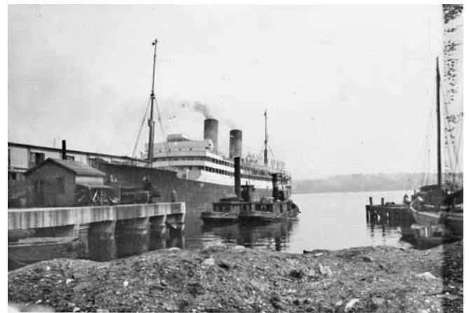
Figure 7. Arthur Lismer, An Ocean Liner Moored in Halifax Harbour , c. 1918–19, photograph, 12 x 17.5 cm, Canadian War Museum, George Metcalf Archival Collection, Arthur Lismer fonds, 19790051-017.