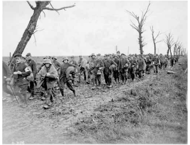
Figure 4. Unidentified photographer, Advance East of Arras—German Prisoners Taken near Monchy, August 1918

When Lismer accepted his June 1918 commission, his letter of authority from the military stated that he was “permitted to make drawings and sketches of the shipping and war activities, Halifax, for the War Records Office. You are not permitted to make sketches, paint, or take photographs of the fortifications.” 45 Although the allowed activities do not specifically include photography, it seems to have been implied in the sentence about forbidden subject matter. From this, it can be deduced that the authorities anticipated that artists sketching in an official capacity on the home front would use cameras when going about their work and, indeed, Lismer did. He was a keen camera user and had set up a darkroom in his bathroom. 46 Lismer’s use of photography, however, was closely bound with his painting practice. In preparation for paintings, he would