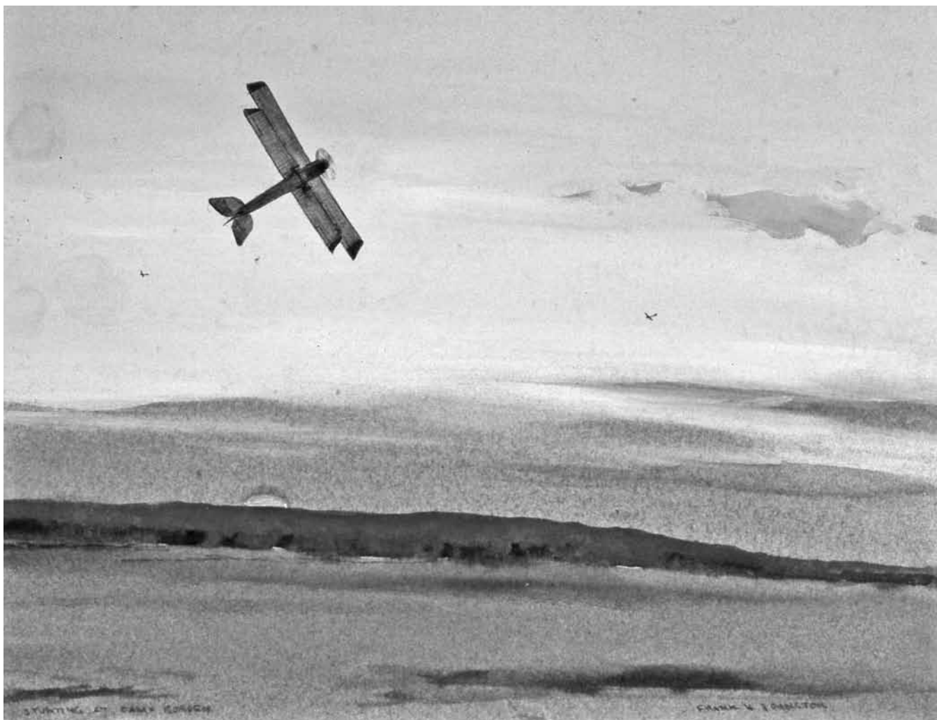
Figure 9. Frank Johnston, Stunting at Camp Borden , undated, watercolour and gouache on art board, 28.4 x 35.8 cm, Canadian War Museum, Beaverbrook Collection of War Art, 19710261-0311.