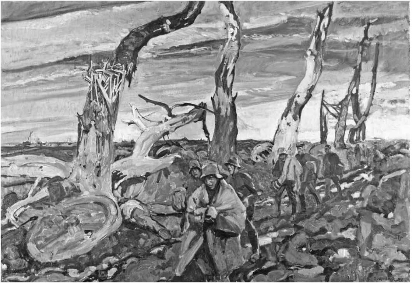
Figure 3. Frederick Varley, German Prisoners , c. 1919, oil on canvas, 127.4 × 183.7 cm, Canadian War Museum, Beaverbrook Collection of War Art, 19710261-0807.