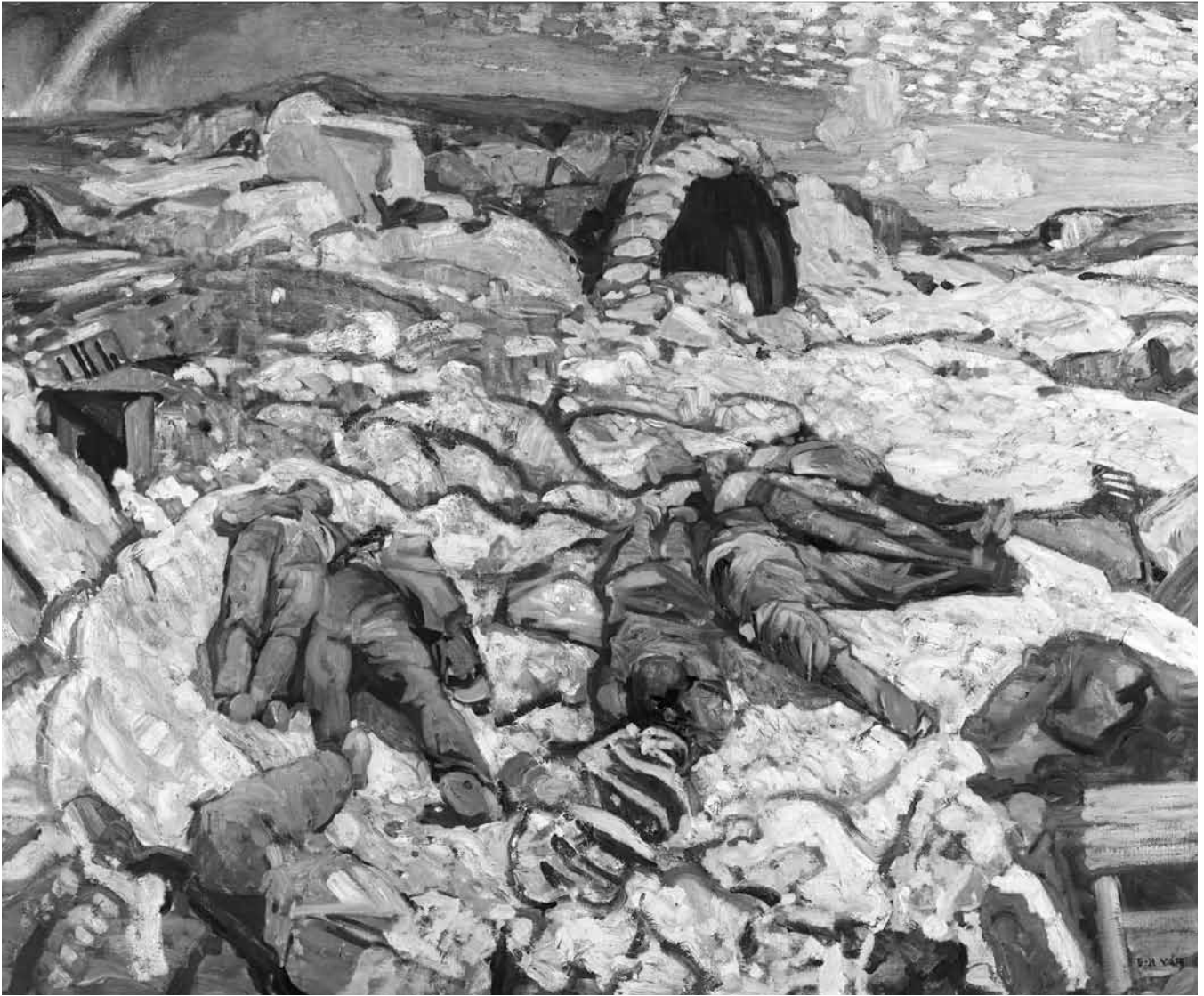
Figure 1. Frederick Varley, The Sunken Road , 1919, oil on canvas, 132.7 x 162.7 cm, Canadian War Museum, Beaverbrook Collection of War Art, I9710261-0771.