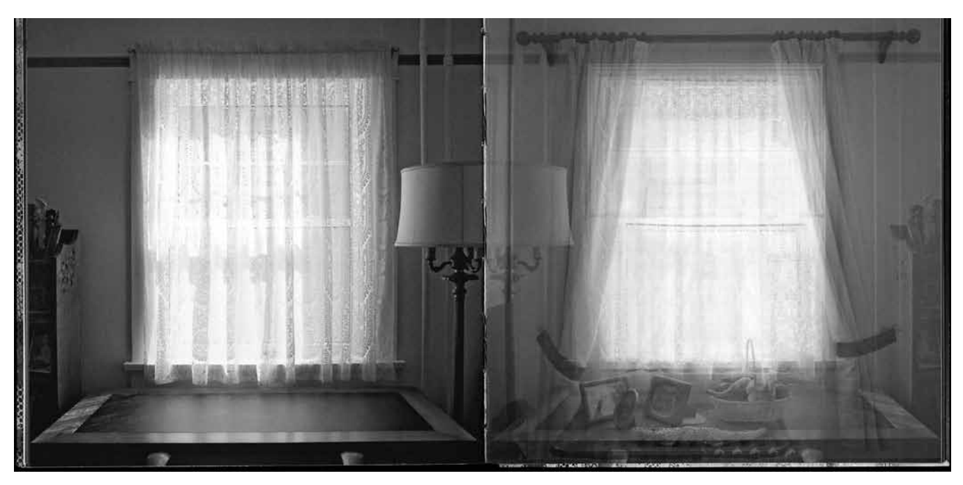
Page spread from Glaze: Veiled, 2013. Inkjet printed, 21 × 41.9 cm.

Corner offers an interplay between the architecture of the book and of the imagery. Photographs of entrances and exits, illuminated by interior and exterior light, flow over the pages to meet at the gutter. Each folded page spread cradles an unoccupied space charged with implied conversations between absent inhabitants.