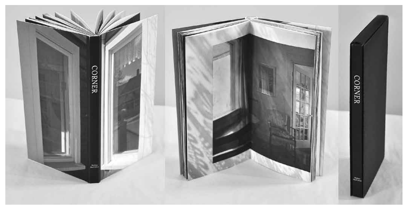
ABOVE: Corner, 2013. Hand-bound codex style bookwork with slipcase, book block printed in photogravure on paper, covers inkjet-printed on coated tyvek, 25.1 × 12.7 × 1.9 cm (closed).

Glaze: Reveal and Veiled present twenty-four images of Townsite windows grouped and layered into two distinct sequences. The structure is a dos à dos (two books bound together, readable from opposite directions), and each side offers a different visual metaphor for memory. Reveal creates intermingled memories that slowly unpeel into a singular image, whereas Veiled presents layered spaces suggestive of blurred recollections.