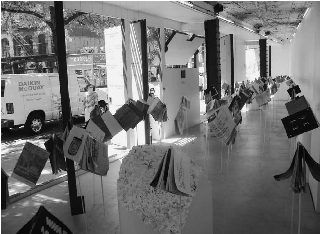
Figure 2. Acconci Studio. The Storefront for Art and Architecture , New York, 1993. Post-2008 reconstruction.

architectural program.” 30 Archigram’s science-fiction-like conjectural drawings and collages, far from being propaganda for positivistic technocratic utopias (in the mode of Le Corbusier or brutalism) were a collision with the future where technology served to create a new ecosystem of the built that questioned the very grounds of the discipline and conjectured buildings that were not fixed objects or monuments, but rather might move, or be evolved by their users, or disappear altogether. Archigram’s was a polemic practice in which a light-footed tuning to the logic of particular technologies became a device or a gambit for upsetting the kind of architecture that technology is habitually geared to maintain. They posited not a technology that keeps control but one that wanders according to a momentary logic of use—a Trojan horse in the house of techno-culture. Just as Acconci suggests that words might become “fact” and wander from the page into the city as a “continuation of poetry by other