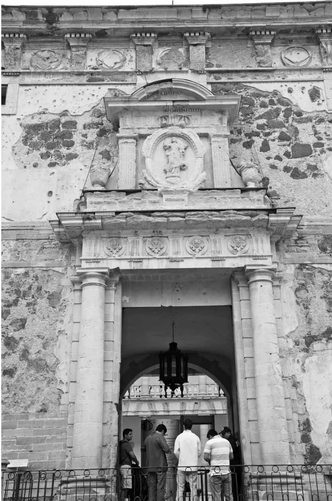
Figure II. Granary of Granaditas, Guanajuato. North portal adorned with a sculptural relief.