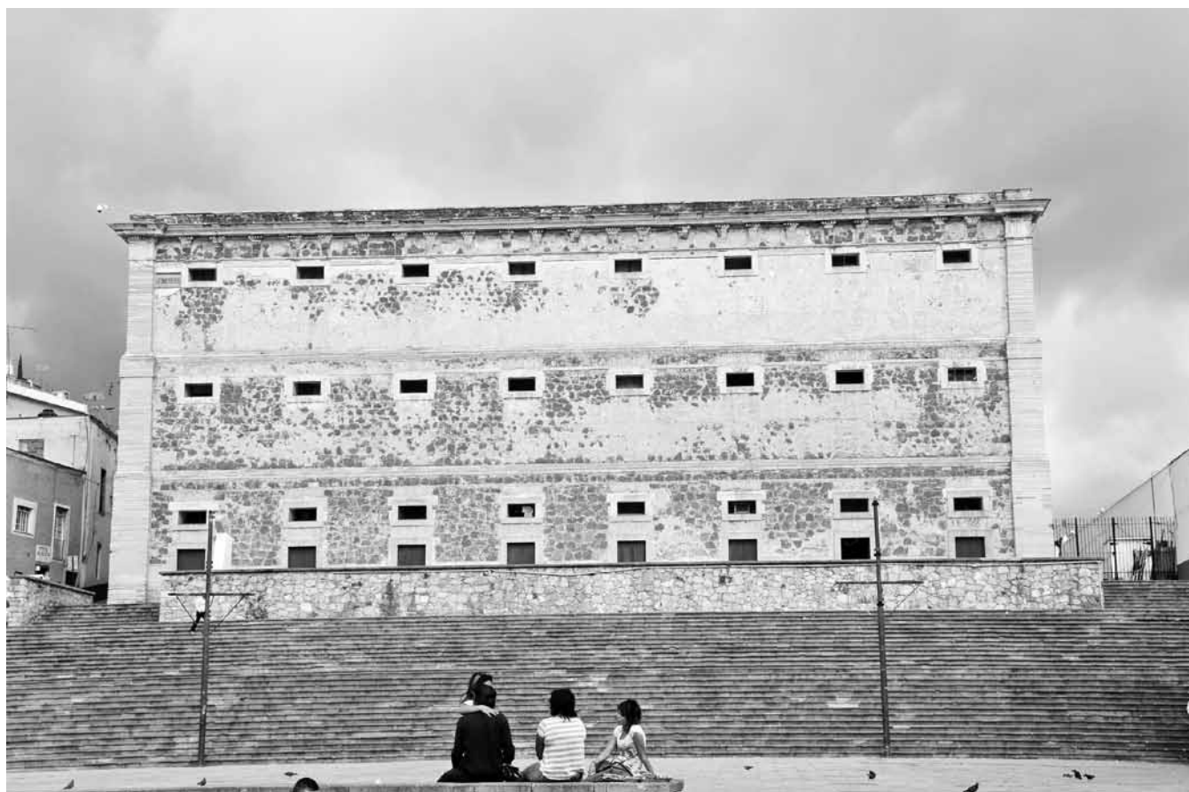
Figure 8. Granary of Granaditas, Guanajuato. West façade.

As soon as excavations began, Mazo and the city commissioners realized the previous budget would be vastly insufficient. Through various trial excavations, Mazo concluded that the land consisted of three types of stone: a “rock solid stone,” “ repetate [a soft-stone] composed of consistent and solid particles but friable in their union,” and a stone “halfway between these two extremes.” Mazo added the cost of the tools and powder needed for the excavations to the price of the houses and land site purchased. His new budget for the completion of the granary amounted to 53,000 pesos more than the one originally planned by Durán, and for which the viceregal licence had been granted. 47