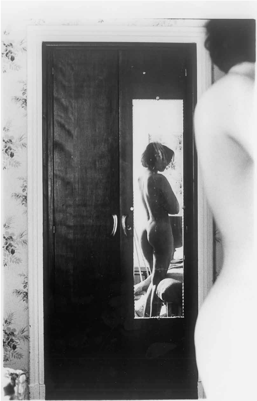
Figure 2. Alix Cléo Roubaud, La Bourboule, chambre 14 (Photo courtesy Jacques Roubaud and Éditions du Seuil).