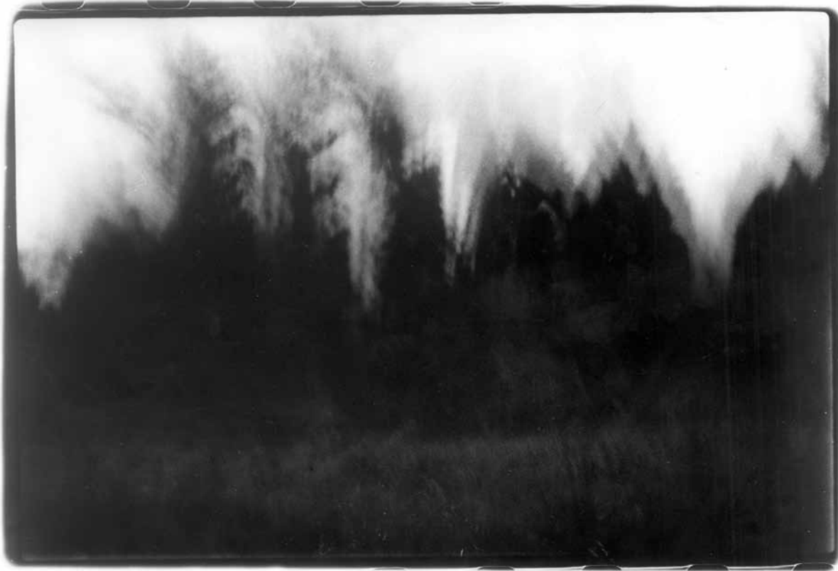
Figure 4. Alix Cléo Roubaud, Quinze minutes la nuit au rythme de la respiration (Photo courtesy Jacques Roubaud and Éditions du Seuil).

aesthetic that only became fully formalized in art after her death. But, subtended to these bodily explorations, oscillating between subjective and objective views, was the presence of a chronic illness that profoundly limited her ability to work. At a symbolic level, air and breath would also seem to be a viable way of negotiating such boundaries, and indeed Roubaud's work is most profound when her struggle for air is literally mapped onto her struggle for self-expression in photography.