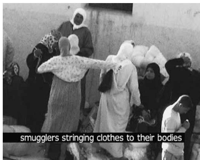
Figure 7. Ursula Biemann and Angela Sanders, Europlex , 2003. Video still, 20 min. (artwork © Ursula Biemann).