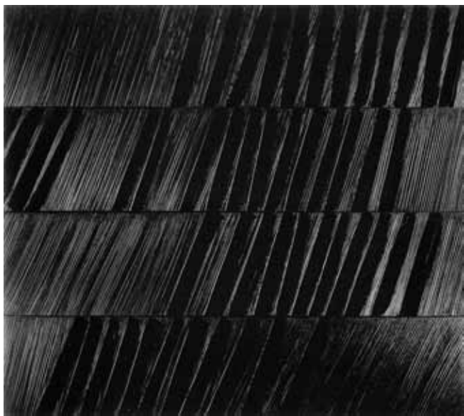
Figure 2. Pierre Soulages, Peinture 324 x 362 cm, 1986 (polyptych G). Oil on canvas, 324 x 362 cm; four panels, each panel, 81 x 362 cm.

from Soulages's ultrablack paintings. While Soulages remains open to textural accidents in his works, the precision of his incised marks in the black pigment underscores the formal rigour of a method that refuses the aleatoric instances emerging in Dubuffet's work. Moreover, the exactitude of the measures of pigment and resin binder ensures a chromatic and viscous conformity in Soulages's paintings, a conformity that runs counter to Dubuffet's textural innovations and experiments.