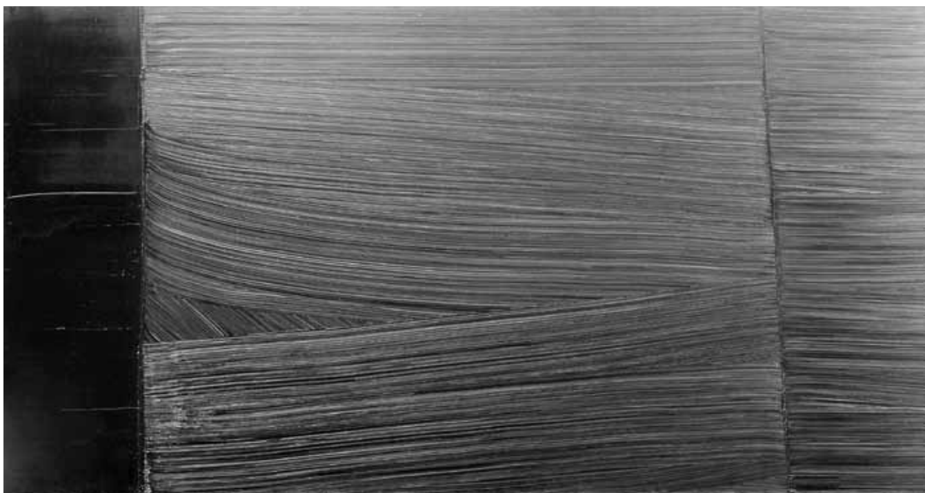
Figure 1. Pierre Soulages, Peinture 162 x 310 cm, 14 août 1979 . Oil on canvas, 162 x 310 cm.

the fall of 1979, 10 which featured eight paintings from that year and fifteen paintings done between 1969 and 1978. The difference between the last work from 1978, Peinture 114 x 162 cm, 17 octobre 1978 (no. 775), 11 and the first work from 1979, Peinture 162 x 114 cm, 27 février 1979 (no. 781), was immediately visible. In the 1978 work Soulages played on the contrast between two tonal values of dark colour by superimposing large marks in opaque black on a ground entirely covered by a thin coating of lighter black. The 1979 painting, the first existing work in the series of ultrablack paintings, contained three non-textured black rectilinear bands variably posed on a black textured ground. The organization of striated and non-striated areas was still hesitant, and the pictorial surface contained some unpainted areas on the upper right, lower left, and right corners. But, the heavily striated, black on black configuration already revealed the advent of a new technique of making a painting by repeated applications of pigment combined with subsequent erasures and disclosures of the ground, the marks, and the traces of those marks. The juxtaposition of scored and smooth areas first appeared distinctly in Peinture 162 x 127 cm, 11 avril 1979 (no. 785), and, three days later, Peinture 162 x 127 cm, 14 avril 1979 (no. 786) revealed the full potency of an ultrablack painting. In the latter work the textured skin of black