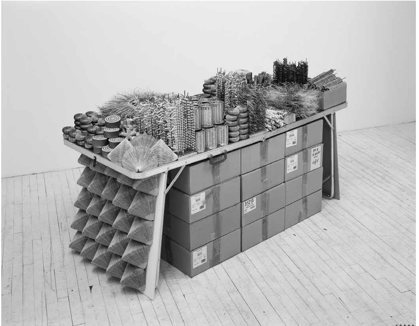
Figure 1. Jérôme Fortin, New York, New York , 1996–2005. Mixed media. Collection of the artist.

are actually made from strips of cut plastic bottles, a jarringly permanent material.