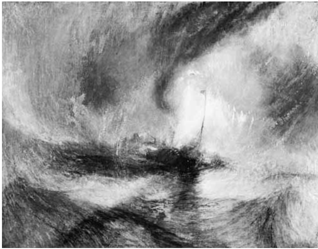
Figure 2. Joseph Mallord William Turner, Snowstorm: Steamboat off a Harbour's Mouth , 1842. Oil on canvas, 91.4 x 121.9 cm. The Tate Gallery/Digital Image © Tate, London 2009.

the Sublime,” nature is dispelled into enigmatic sensations that are translated, through subreption, into representations that are merely analogous to the magnitude of reason. In this way, the sublime aesthetic is rooted in a determination to gain “dominion” over nature. 20