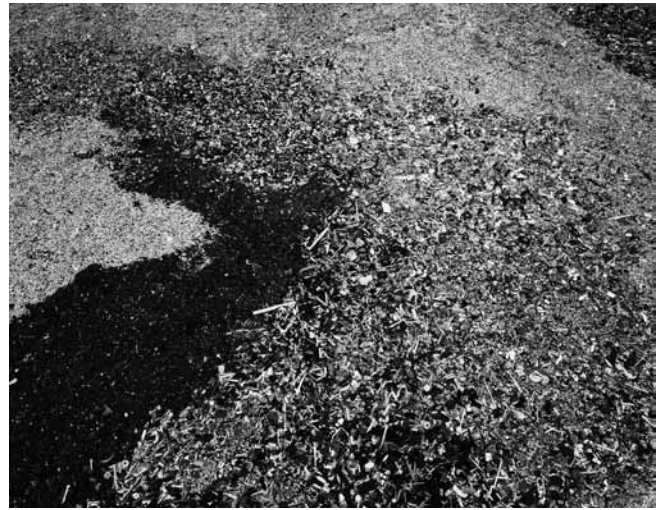
Figure 3. Edward Burtynsky, China Recycling #8, Plastic Toy Parts , Guiyu, Guangdong Province, China, 2004. Chromogenic colour print.

In many ways, Joseph Mallord William Turner's paintings epitomize the scenario of the Burkean sublime, in which nature is a malevolent atmosphere that threatens to obscure sight and overwhelm thought. In Snow Storm: Steamboat off a Harbour's Mouth (1842, fig. 2), for example, ocean, cloud, and sleet combine in a swirling tidal wave to descend on a barely discernable ship, located in the eye of the storm at the centre of the canvas. Similar in composition, Burtynsky's China Recycling #8, Plastic Toy Parts (2004, fig. 3) depicts curvilinear bands of colour that rear into an array of sky blue, muddy black, and gray punctuated with bursts of red, pink, and yellow. Fluid as this vortex of colour appears, it is not a rancorous tempest but a heap of trash: