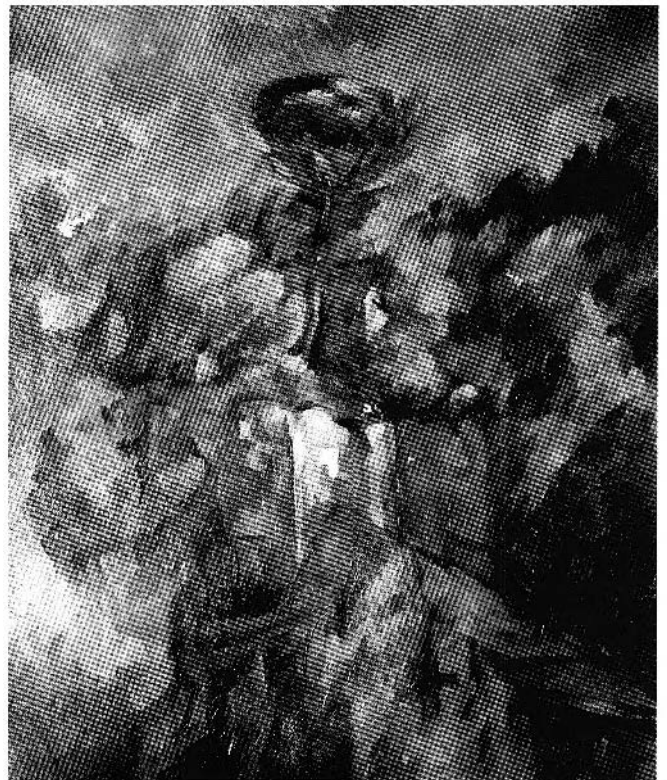
Figure 1. Paul Cézanne, La Carrière de Bibémus , ca. 1892. Oil on canvas. Private Collection.

These are very different representations, and scale and point of view are indeterminate throughout, making Bibémus extremely difficult to tally as the sum of the paintings' individual parts. The first several generations of writers on Cézanne are largely silent on questions of where we, as viewers, might be and how one corner of the quarry might relate to the next. For them landscape motifs counted less as individual places than as points of departure for more grandly philosophical destinations, the ideal structures beneath nature's phenomenal surface, or "the logic of organized sensation." 3 In the last few years, though, discussions of Cézanne's work have focused increasingly on his devotion to his Provençal origins and especially on his conviction that the Provençal landscape could be made to stand for origins as such, be they individual, material, or philosophical. 4 With its primal character and emphatically unformed materiality, Bibémus plays an important role in these discussions: both Paul Smith and Nina Athanassoglou-Kallmyer, for example, point out that it would be easy to imagine this landscape as the handiwork of demigods or giants, and argue that Cézanne would have very much liked the way such mythological explanations literally ground Bibémus and his other Provençal subjects in the dawn of Creation. 5