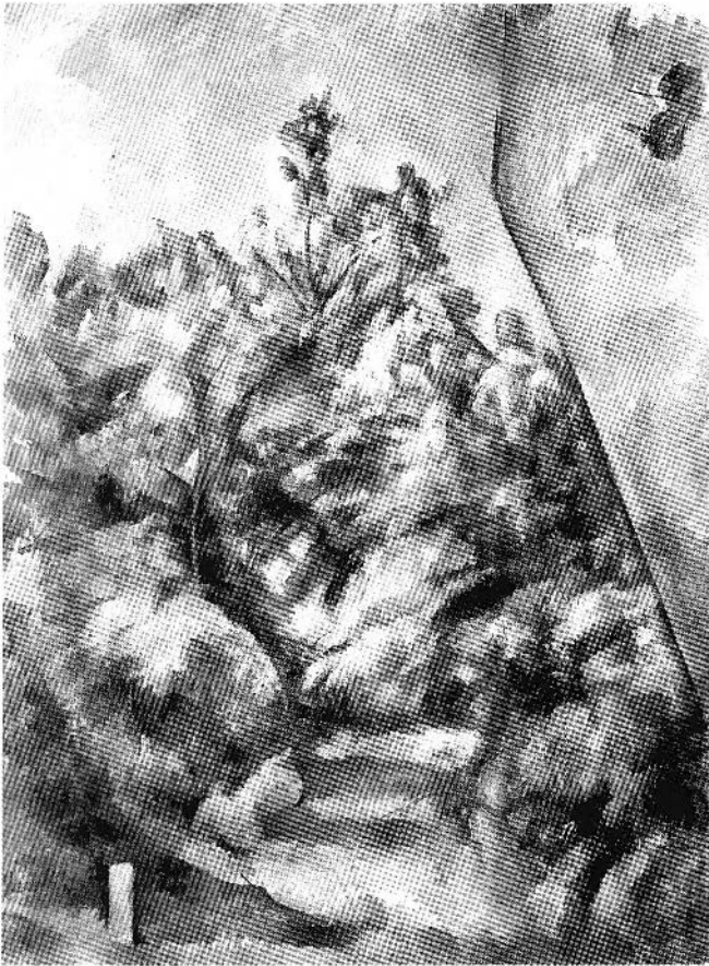
Figure 2. Paul Cézanne, Le Rocher Rouge , ca. 1896–97. Oil on canvas, 92 x 68 cm. Musée de l'Orangerie, Paris (Photo: Hervé Lewandowski, Réunion des Musées Nationaux / Art Resource, NY).

prominent in the Bibémus paintings—that stands paradoxically against the sense of compositional coherence and that makes Cézanne's late paintings notoriously difficult to describe.