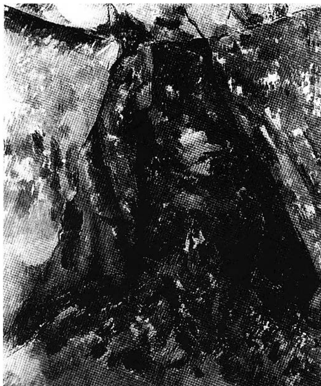
Figure 7. Paul Cézanne, Dans la Carrière de Bibémus , ca. 1895. Oil on canvas, private collection (Photo: reproduced in Nina Maria Athanassoglou-Kallmyer, Cézanne in Provence: The Painter in His Culture , Chicago and London, 2003, 170).

that they can make reference to gravity, to erosion and an increase of entropy, but never succumb. And this creates a remarkable tension: what the tache is holding back is the rock's absolute indifference, and ultimately resistance, to the tache's own timescale. It seems a very thin container for the millions of years the earth's processes have spent arriving at this point, and an even thinner barrier against the millions to come.