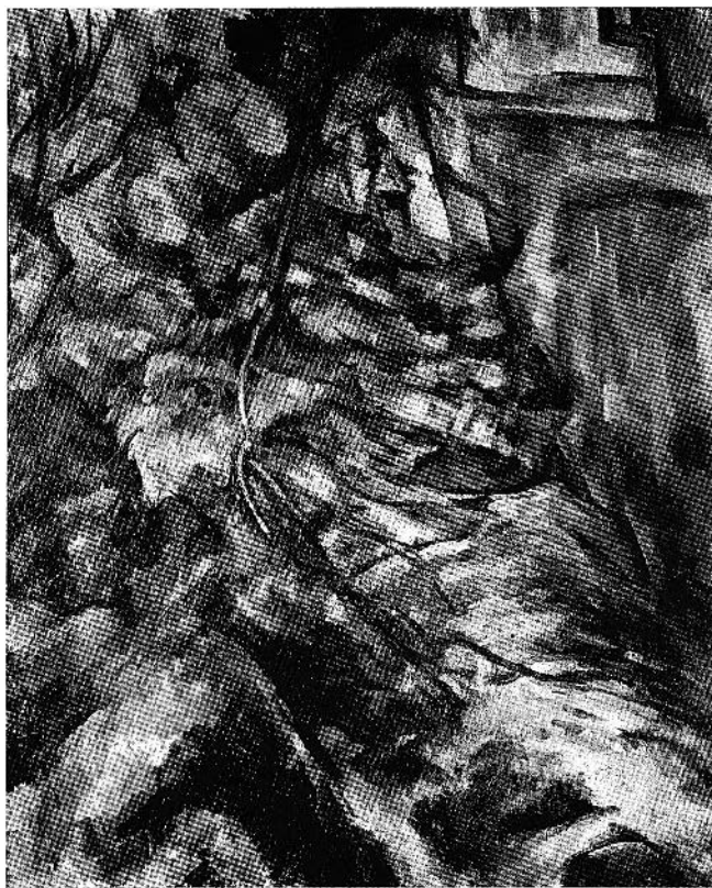
Figure 5. Paul Cézanne, Rochers et branches à Bibémus , 1900–04. Oil on canvas, 61 × 50.5 cm. Petit Palais, Paris.

If there is a painting that refuses to allow nature to remain external to it—as simply responding to the sense data nature