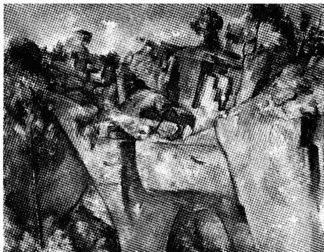
Figure 6. Paul Cézanne, La Carrière de Bibémus , ca. 1895. Oil on canvas, 65 x 81 cm. Museum Folkwang, Essen (Photo: Erich Lessing / Art Resource, NY).

Cézanne did not know where to stop—there is some descriptive value in imagining that slight variations and mutual response of brushstrokes in a canvas being advanced all at once will, eventually, radically undermine any logic that might be apparent in the first mark, since the conversation between the brushstrokes will eventually supercede the original organizing intelligence.