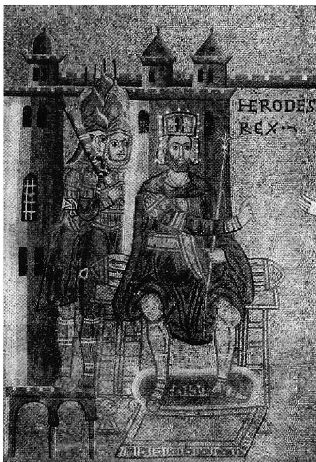
Figure 1a, 1b. Arrest of Saint Peter, north choir chapel, Church of San Marco, Venice.