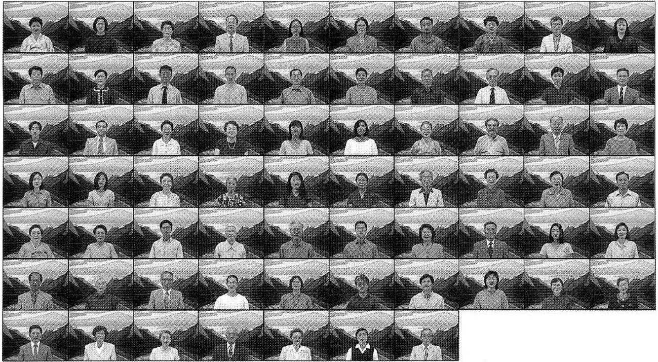
Figure 2. Jin-me Yoon, A Group of Sixty-Seven , 1996. Chromogenic print, 47.6 × 60.3 cm. Vancouver, Vancouver Art Gallery, Vancouver Art Gallery Acquisition Fund.

identify as well as to confuse each pair's possible readings, presenting the viewer with several means of interpreting the pairs and the work as a whole.