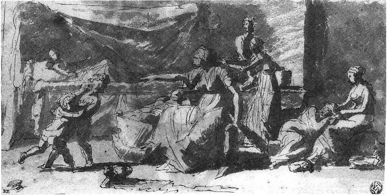
Figure 1. Nicolas Poussin, Domestic Scene in the Interior of a Room , 1643-45. Pen, brown ink and brown wash on paper, 14.8 x 29.1 cm. Paris, Musée du Louvre, Département des arts graphiques.

ments). I therefore contend that part of the current reassessment of Poussin and Poussin scholarship should include the question: How have articulations of gender informed and how do they continue to inform constructions of Poussin?