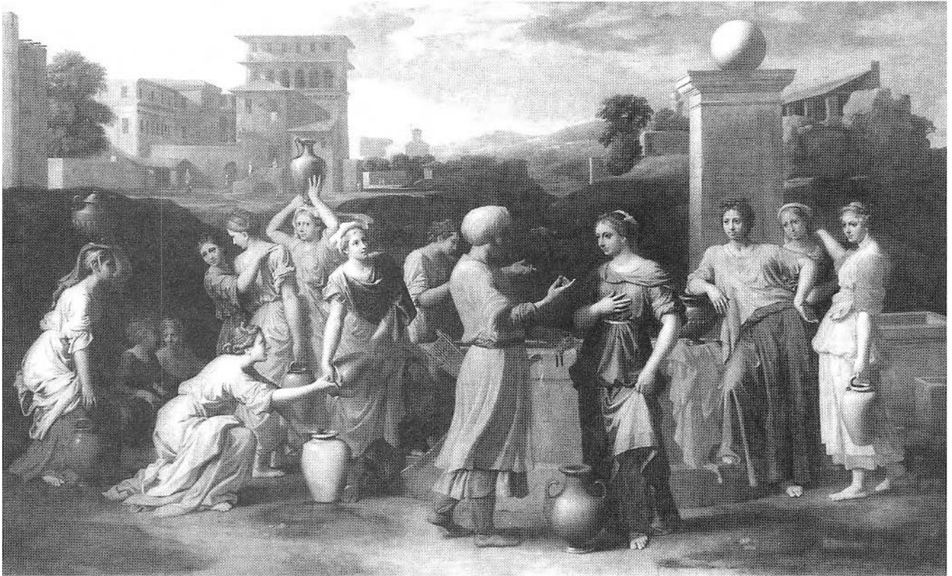
Figure 8. Nicolas Poussin, Rebecca and Eliezar at the Well, 1648. Oil on canvas, 118 x 197 cm. Paris, Musée du Louvre.

cal establishment. Her best-known contest with the royal surgeon Charles Guillemeau concerned the cause of the death in childbed of her patient, Marie de Bourbon-Montpensier, sister-in-law to Louis XIII, in 1627. 63 The publicity surrounding the case effectively ended the illustrious career of the midwife.