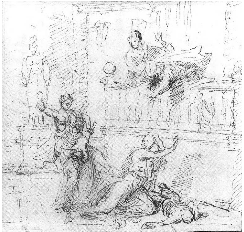
Figure 10. Nicolas Poussin, Medea Killing Her Children , ca. 1648-49. Pen and ink on paper, 15.9 x 16.6 cm. Windsor Castle Royal Library.