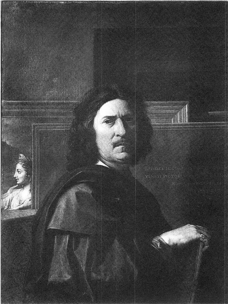
Figure 3. Nicolas Poussin, Self-Portrait , 1649-50. Oil on canvas, 98 x 74 cm. Paris, Musée du Louvre.

to privilege colour and visual pleasure as triumphantly “feminine” aspects of the artist’s work. Such a strategy would simply keep binary distinctions in place. Instead, a feminist reading begins with what Griselda Pollock calls “a political commitment to women.” 33 My feminist revision of Poussin will therefore move from reading for inscriptions of gender in Poussin scholarship to an examination of historical representations of the “feminine” in his work.