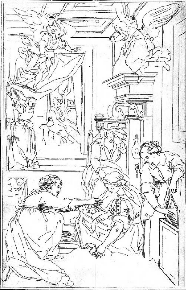
Figure 5. After Federigo Barocci, The Birth of the Virgin . Colour etching, 37.5 x 23.7 cm. London, Wellcome Institute Library (Photo: The Wellcome Institute Library).

Mercury, Pan and so forth. 45 Poussin's drawing of childbirth does not include any obvious mythological signifiers. At the same time, it is not impossible that a literary reference inspired the image. Despite my argument that the drawing represents early-modern birthing practices, it is not my goal to pinpoint its precise subject or sources. Instead, I propose to read the image for its articulation of maternity, an approach not previously undertaken. This interpretation does not exclude other potential readings; it is a strategic one, informed by my current research interests in early-modern representations of childbirth.