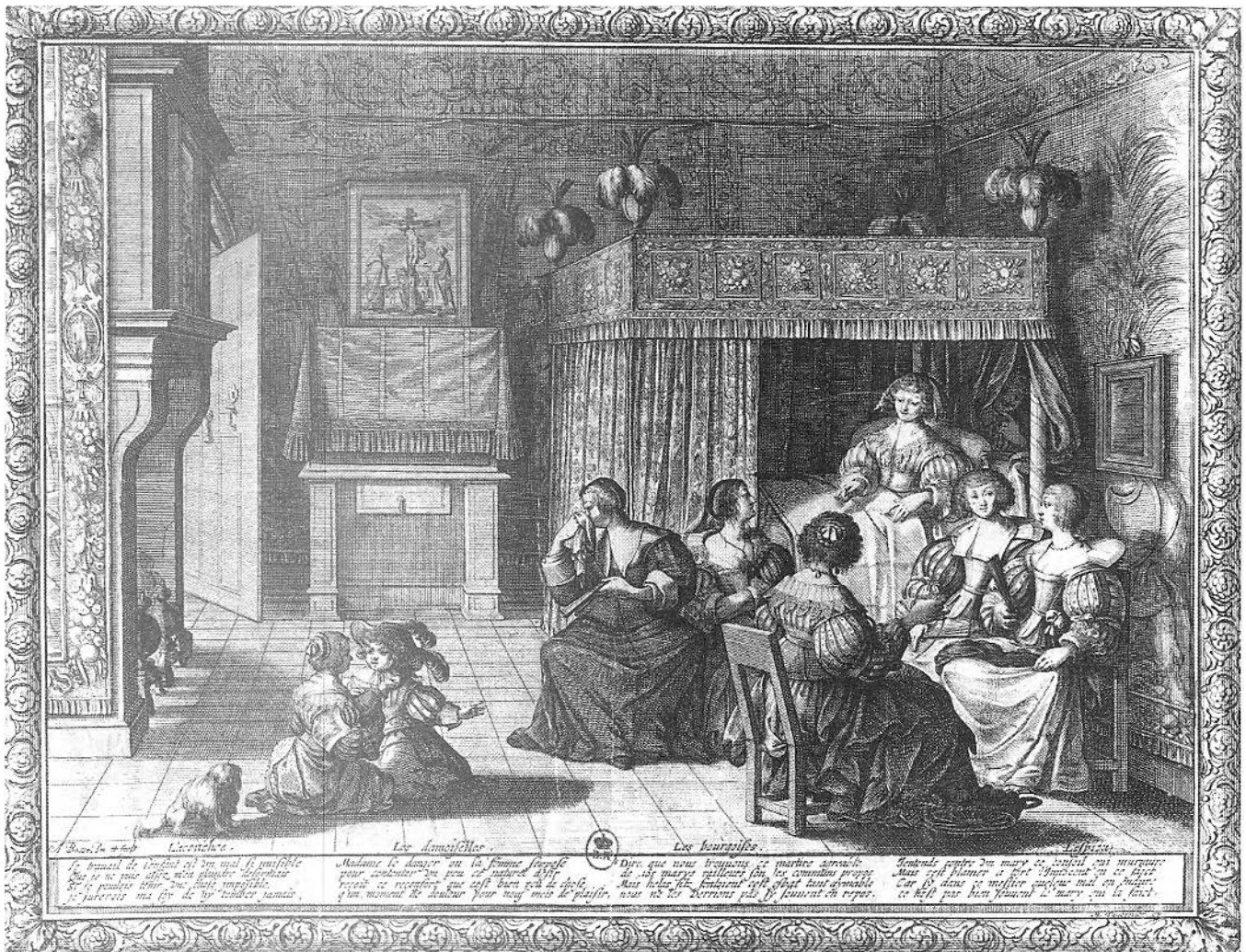
Figure 9. Abraham Bosse, The Visit to the Newly Delivered Woman , ca. 1633. Engraving, 25 x 33 cm. Paris, Bibliothèque Nationale de France.

to the male god Jupiter. 66 For the most part, however, Poussin's work and even his mythological scenes of birth have not been related to issues of maternity.