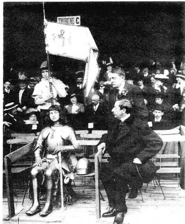
FIGURE 78. Fête de Jeanne d'Arc à Compiègne , le 8 juin 1913. Joan of Arc and, at right, Maurice Barrès.