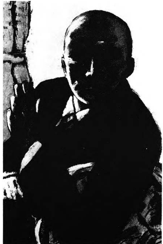
FIGURE 37. Max Beckmann, Self-Portrait in Black , 1944, Munich.