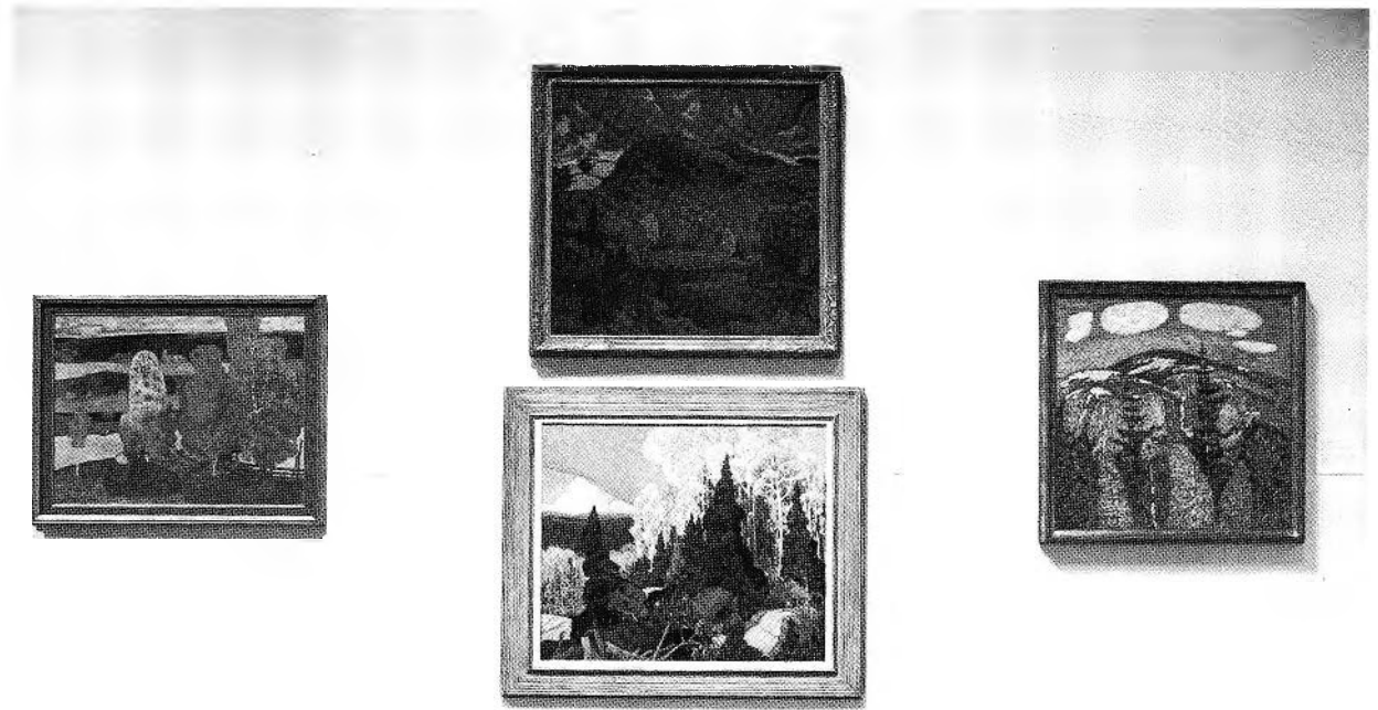
FIGURE 3. The Mystic North, works by Helmer Osslund (98/51), J.E.H. MacDonald (77/122), Franklin Carmichael (3/123) and Marsden Hartley (44/136).