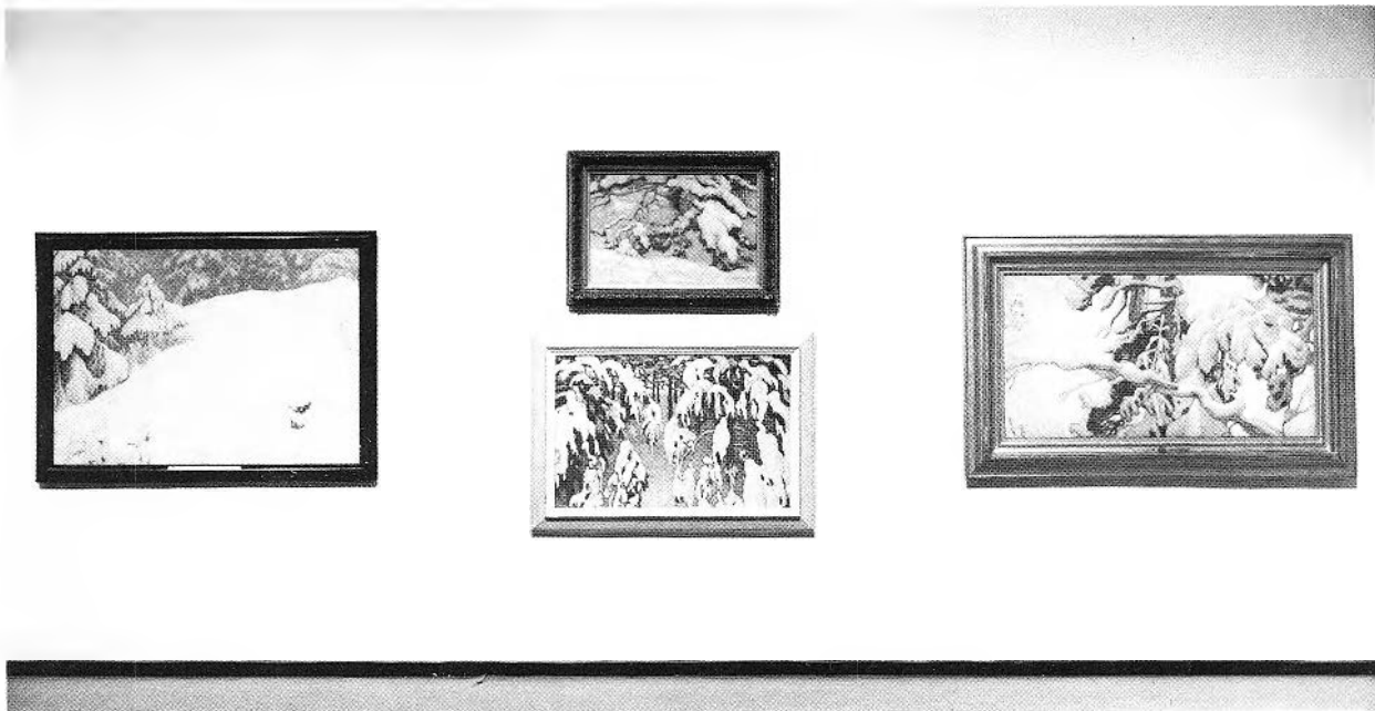
FIGURE 1. Installation view of The Mystic North, Art Gallery of Ontario. Works by Gustaf Fjaestad (19/45), J.E.H. MacDonald (69/108), Lawren Harris (37/109) and Akseli Gallen-Kallela (28/30). Numbers refer to the catalogue, followed by plate numbers corresponding to the publication.