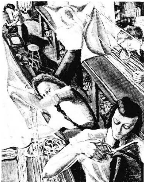
FIGURE 10. Paraskeva Clark, Parachute Riggers , 1946-47, cat. 36. Ottawa, Canadian War Museum, National Museum of Man, National Museums of Canada (Inv. 14,086).

publication is necessarily conditioned by extra cost. Watson, by selecting a colour detail from Robinson's 1922 painting St. Joseph (cat. 13) for the cover, solves in part the dilemma of providing a colour illustration of Robinson's work as well as presenting an appealing cover design to help the marketing of the publication. One only regrets that the Kitchener-Waterloo Art Gallery did not see its way clear to fund exhaustive colour illustrations of the paintings of an artist whose work depends upon his skills as a colourist.