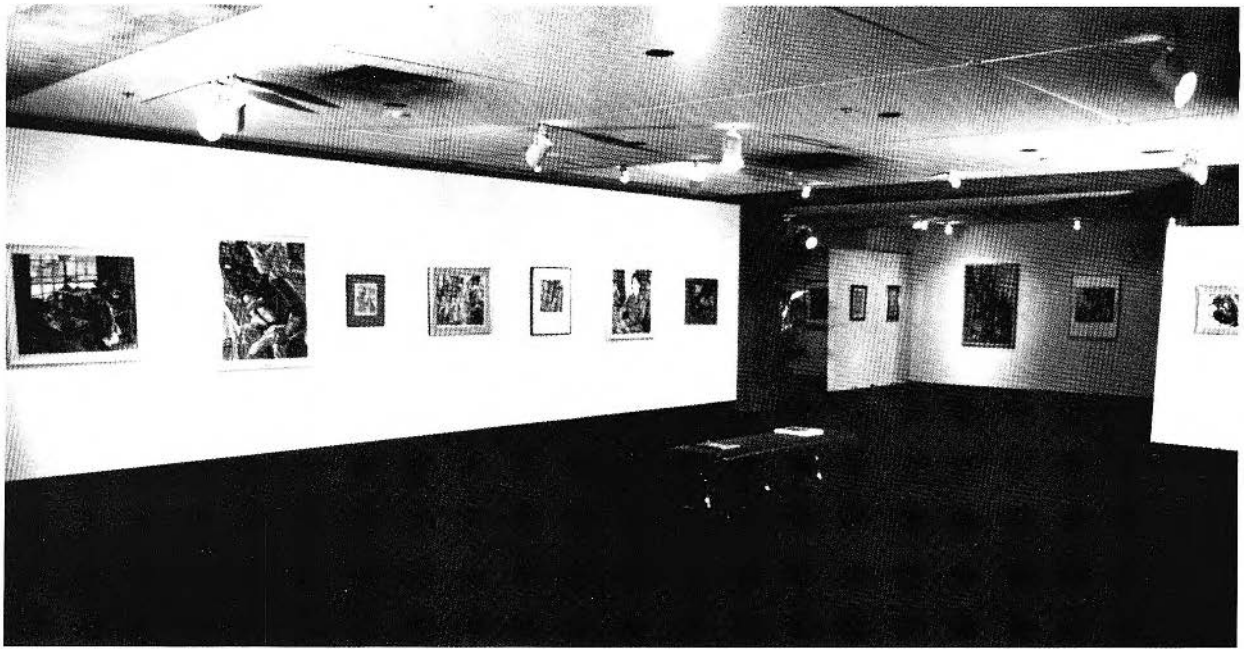
FIGURE 7. Installation view, Paraskeva Clark: Paintings and Drawings, Dalhousie University Art Gallery, Halifax.