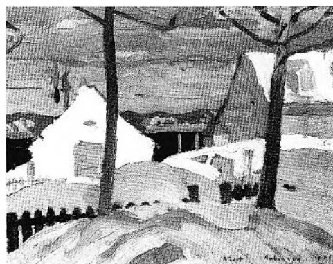
FIGURE 4. Albert H. Robinson, oil sketch for Cacouna , 1921, cat. 5.