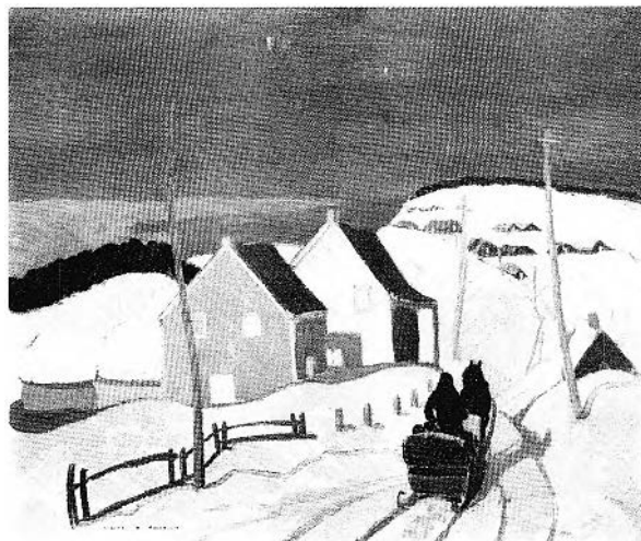
FIGURE 6. Albert H. Robinson, Moonlight, Saint-Tite des Caps , 1941, cat. 46. Ottawa, National Gallery of Canada.