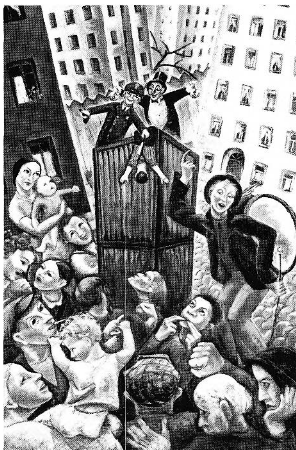
FIGURE 8. Paraskeva Clark, Petroushka , 1937, cat. 17. Ottawa, National Gallery of Canada. This painting, considered by the artist to be her finest, was shown at the New York World's Fair of 1939.

The unity established by the author and the designer between illustration and written text is central to the success of the exhibition publication, remaining as it is, the sole tangible residual of the exhibition after its inevitable dispersal. Both Watson and MacLachlan have wisely illustrated each work exhibited and included important illustrations of works not included but pertinent to the concept of each exhibition. MacLachlan has added supplementary illustrations of the artist and events signalling the fullness of the artist's life. The major weakness, characteristic of most art exhibition catalogues is the practice, in both cases, of not integrating the illustration of the exhibited works in the catalogue essay where they are discussed. While this may not be a problem for those familiar with the works it can present unnecessary complications for the general reader. Coloured illustration in any exhibition