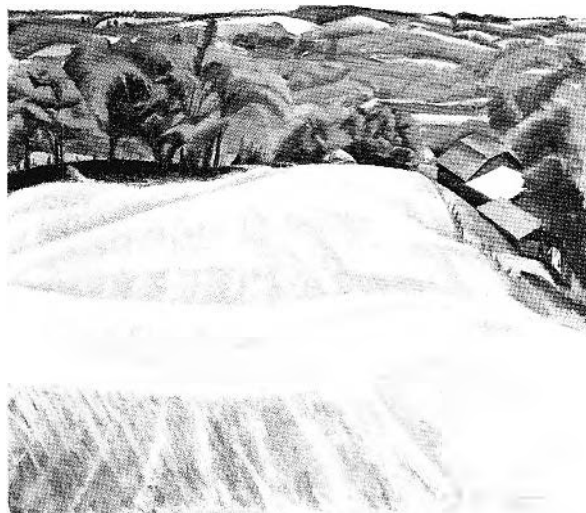
FIGURE 2. Paraskeva Clark, Wheat Field , 1936. Ottawa, National Gallery of Canada. Both paintings (Figs. 1 and 2) were included in the exhibition A Century of Canadian Art , Tate Gallery, London, England, in 1938.