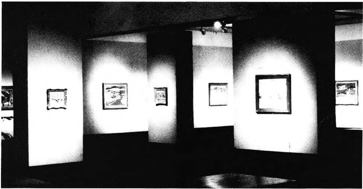
FIGURE 3. Installation view, Albert H. Robinson: The Mature Years , Kitchener-Waterloo Art Gallery.

But while Robinson and Clark share a common history of participation in these exhibitions, they participated individually in quite separate group exhibitions which underscore basic differences. Robinson, included as an invited contributor to the exhibitions of the Group of Seven, had several works selected for the British Empire Exhibition at Wembley, England in 1924 and 1925 – exhibitions that would bring the first international acknowledgement of a modern national school of Canadian painting – by the Group of Seven. Clark, by 1940, was an exhibitor with the Contemporary Arts Society in its important exhibition of Art of Our Day in Canada embracing international modernism. By looking at Albert H. Robinson: The Mature Years and Paraskeva Clark: Paintings and Drawings , it is possible to gain insight into what modernism meant to Canadian painting through the eyes of two painters who, until now, have been virtually relegated to the rank of minor Canadian artists. These exhibitions ask that we reconsider their achievements in light of the mainstream developments in Canadian art from 1920 to 1950.