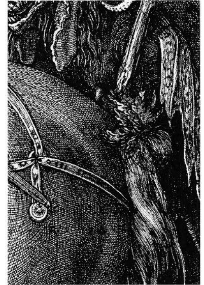
FIGURE 4. Dürer, The Knight, Death and the Devil , detail of horse's tail.

Four Books . And Charles continued to acquire prints and pictures by Dürer throughout his reign. 9