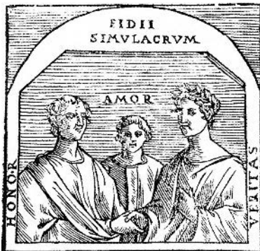
FIGURE 9. Fidii Simulacrum , from Vincenzo Cartari, Imagini delli Dei de gl'Antichi (Venice, 1647); facsimile reprint, Graz, 1963, 8.

maturity. One also notes that the king, unlike the Genoese noble, keeps his right gauntlet on — as Mars — but has discarded his left. This hand has, presumably, already been softened by his Queen, Venus- Carità . And of course, the Hermitage pictures are more 'Baroque,' the figures 'break the space' to include the spectator, Lord Wharton.