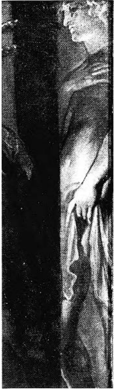
FIGURE 7. Van Dyck, Venus Pudica , detail from the Lomellini Family . Edinburgh, National Gallery of Scotland.