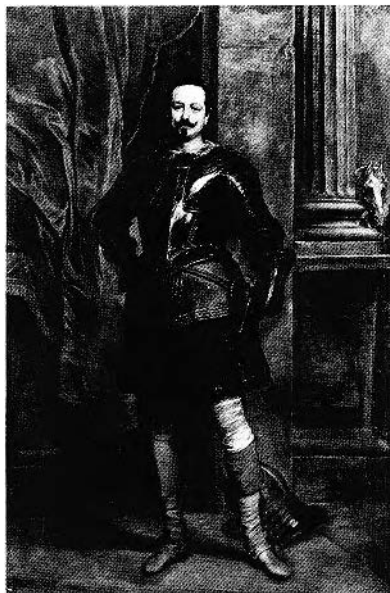
FIGURE 10. Van Dyck, Marchese Filippo Spinola . Brisbane, Queensland Art Gallery.