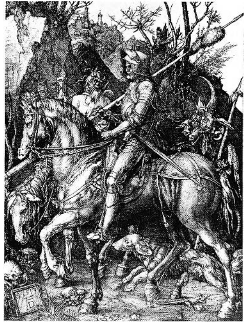
FIGURE 2. Dürer, The Knight, Death and the Devil .

Titiano . 6 As a result van Dyck's picture has been seen as a re-interpretation of Titian's equestrian portrait of Charles V now in the Prado. 7 But the fact that both are in profile, and have landscapes, are really the only formal connexions. Dürer's print is surely far closer.