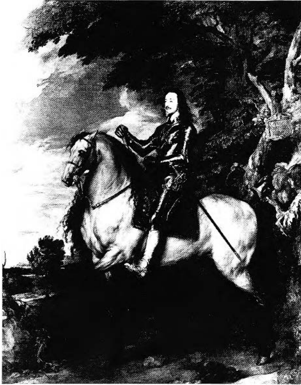
FIGURE 1. Van Dyck, Charles I . London, National Gallery.

ceived intensive study, formally and iconographically. In an exemplary small monograph, Dr. Roy Strong tackles the picture on numerous levels and explores its sources and meaning from many angles, from antiquity onwards. 4 But neither he, nor anyone else in print as far as I can determine, seems ever to mention as a possible source Dürer's great 1513 engraving, The Knight, Death and the Devil (Fig. 2). Yet the formal connexions seem very close, especially between the poses of the horses, and to a lesser extent the riders. Even van Dyck's employment of a cartouche for the king's title might have been suggested by the plaque which Dürer uses for his monogram and date. 5