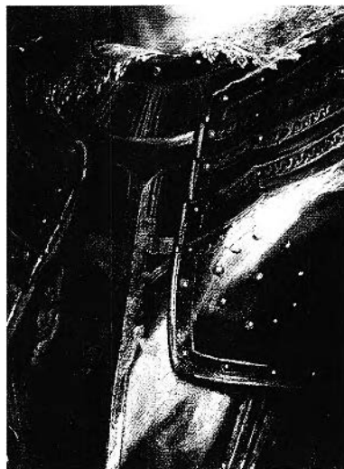
FIGURE 11. Van Dyck, Marchese Filippo Spinola , detail.

Thus the van Dyck Spinola appears to derive ultimately from religious imagery and still carries