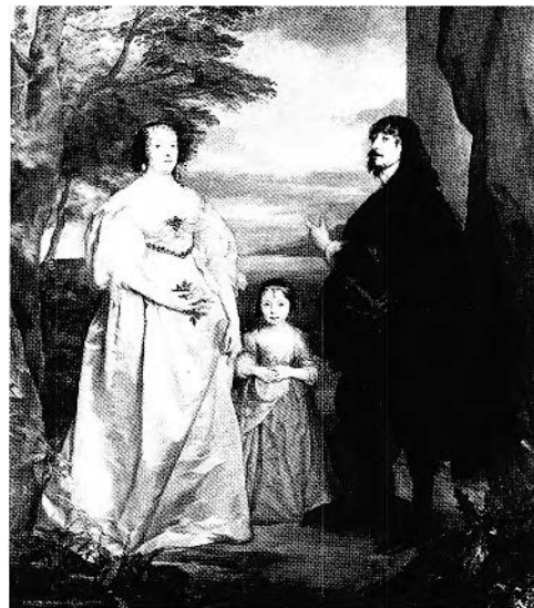
FIGURE 8. Van Dyck, James, 7th Earl of Derby, His Lady and Child . New York, The Frick Collection.

As always with van Dyck one sees how much hands matter. A reading of the hands of the Lomellini Family corresponds precisely with the Mars-Venus interpretation. And this unification of the picture is strengthened by the interpretation of the 'Contemplative,' and the Venus statue. Nor is the agitated pose of the left-hand figure in the Lomellini Family to be interpreted as 'bad drawing,' 30 any more than that of Lord Strange. Both show the aggressiveness of Mars, being softened by Venus. But according to the myth, and the mode of conduct it sanctioned, Mars never lost