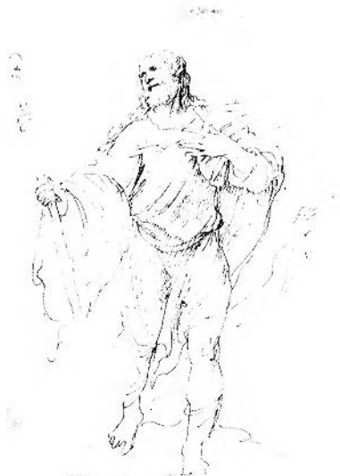
FIGURE 13. Van Dyck, copy of Titian's St. James (Venice, S. Lio), pen and ink, from the Italian Sketchbook . London, British Museum.

I have encountered much opposition to the idea that the parrot could have a religious meaning in portraits, i.e. in a 'secular' context. But this resistance has not been without its use. It has forced me to search for earlier instances of the parrot, with a religious meaning, in a portrait.