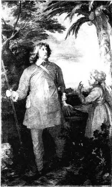
FIGURE 12. Van Dyck, William Fielding, 1st Earl of Denbigh . London, National Gallery.

the kind of clothing often worn by Europeans travelling in the East. According to family tradition (now generally discounted) the picture describes an incident when the earl lost his way and was led to safety by a native boy. 41