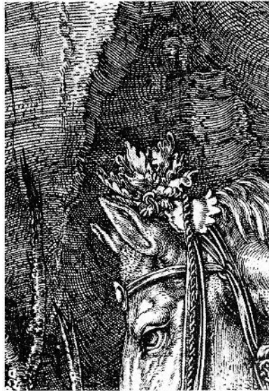
FIGURE 3. Dürer, The Knight, Death and the Devil , detail of horse's head.