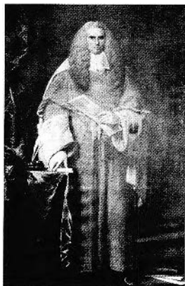
FIGURE 2. Benjamin West, Chief Justice Benjamin Strange , 1798. Oil painting approximately 244 × 152 cm. Halifax County Court House, Halifax, Nova Scotia.