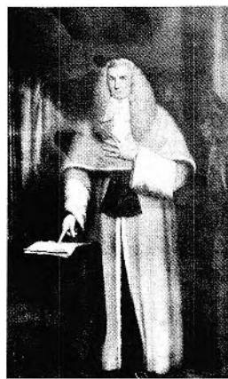
FIGURE 5. John Poad Drake, Chief Justice Samuel Salton Blowers , c. 1820. Oil painting, approximately 244 × 152 cm. Halifax County Court House, Halifax, Nova Scotia.

optimistic view of the possibilities for the fine arts as represented by the Exhibition, and an appreciation of its moral and philosophical effects. Though one might in hindsight legitimately question the mentality behind cultural ideals which praised efforts by native artists to copy European originals (since most local work did consist of such works) instead of looking within for inspiration, one must recall that painting was as yet a novelty to most of the students, as well as to most of the visitors to the Exhibition. The community-wide appreciation of the event, evident in the notices which appeared in various newspapers during the month of May, as well as in the Halifax Monthly Magazine , can also be looked at as an indication of the growth of cultural awareness and development. Such awareness did not spring up overnight, but the 1830 Exhibition was the first large step in its serious development and later consolidation.