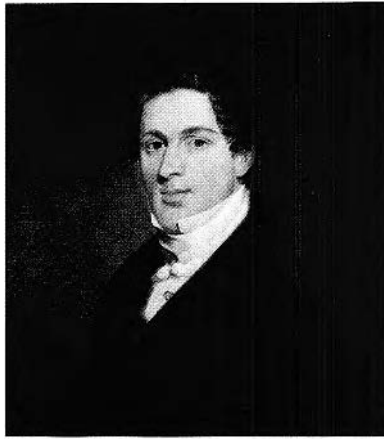
FIGURE 7. William Valentine, Portrait of a man , 1827. Oil painting, 43.2 × 38.1 cm. National Gallery of Canada.

gion.' Once more, the allusion is made to the fine arts as a morally uplifting element in the community, with greater directness than before. Even leaving that aside, the 1831 exhibition still remains an impressive effort on the part of the Halifax community.