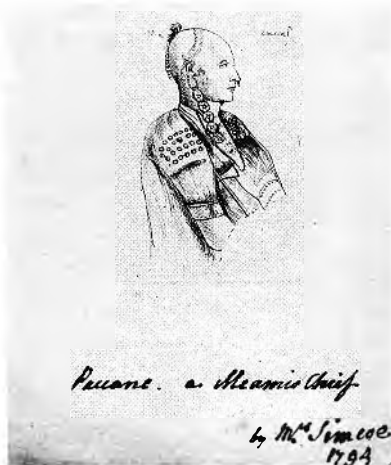
FIGURE 3. Paccane, a Meamis Chief. Reputedly drawn and etched by Elizabeth Posthuma Gwillim Simcoe, 1793-94. Not in exhibition. Ottawa, Public Archives of Canada (Photo: Public Archives of Canada).