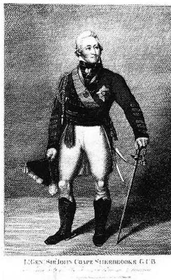
FIGURE 2. L' Genl Sir John Coape Sherbrooke, G.C.B. Painted, engraved, and published by Robert Field, Halifax, N.S., 24 June 1816. Cat. 14. Ottawa, Public Archives of Canada.