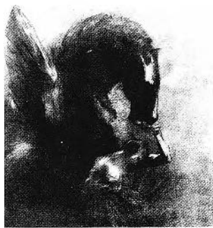
FIGURE 3. Odilon Redon, Pégase captif , 1889. Ottawa, National Gallery of Canada.