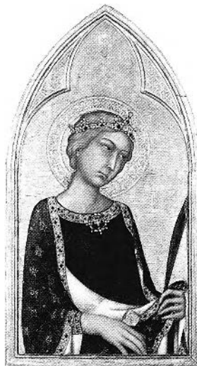
FIGURE 1. Simone Martini, St. Catherine of Alexandria, ca. 1320. Ottawa, National Gallery of Canada.