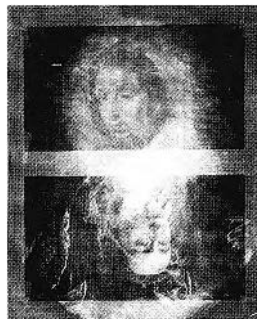
FIGURE 5. Allan Ramsay, Portrait of Mrs. Lindesay of Eaglescarnie . X-ray photograph.

No. 3 , 1975. Alan Sondheim, University of Ottawa, introduced Robin Collyer's Recent Sculptures: Without the Concepts of Space and Time , 1976, We Can Build Belief Systems , 1976 (Fig. 4). Chantal Pontbriand, Parachute , spoke on Pierre Boogaerts: propositions à partir d'un travail photographique .