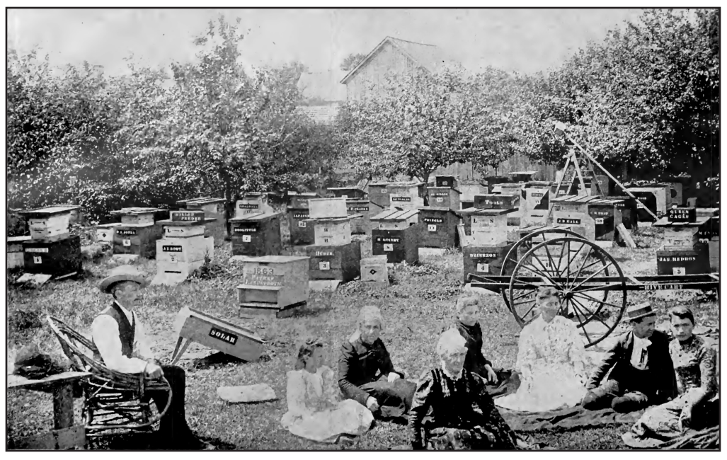
F.A. Gemmell Apiary, Stratford, Ontario, c.1893. Note the hives in the background are named, rather than numbered, after prominent beekeepers in the United States and Canada.

They published columns and convention reports in international apiculture periodicals and hosted continental events, such as the North American Bee-keepers' Convention, held in Toronto in 1895. Beekeepers across southern Ontario also participated in these international forums, subscribing to American beekeeping periodicals and attending regional and international beekeeper association meetings. Ontario beekeepers were well represented at the World's Columbia Exposition in Chicago in 1893, taking away seventeen apiculture awards, "more than twice as many as that taken by any State in the Union, or any other foreign country."5