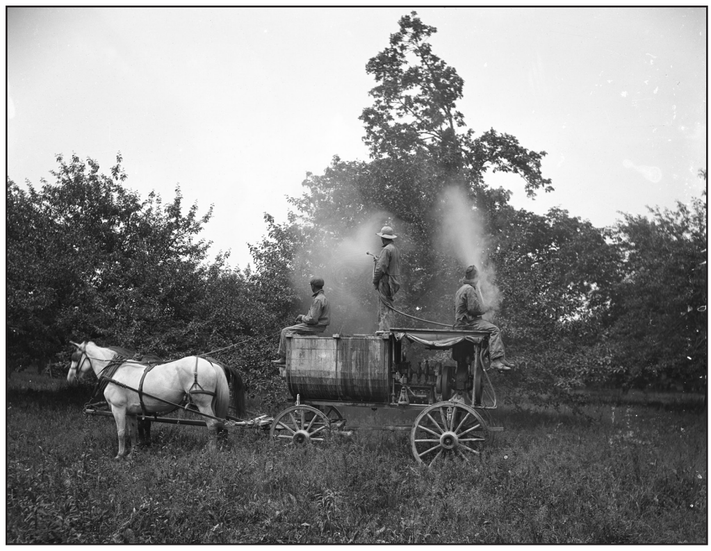
Spraying fruit trees with horse-powered spray jig near Ayr in southwestern Ontario, c.1910.

of barrels. I attribute the change altogether to spraying in the proper season.<sup>13</sup>