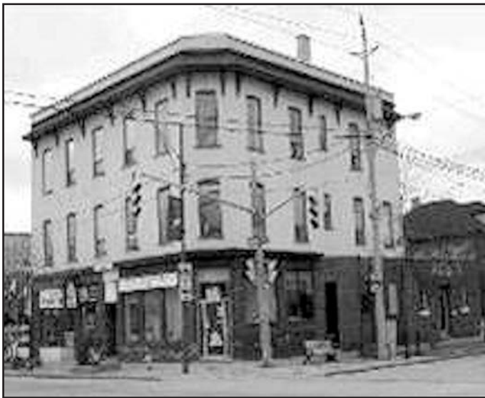
The Jules Robinet winery.