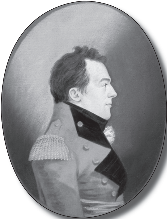
Pastel portrait of Major-General Sir Isaac Brock, K.B., attributed to Gerrit Schipper (1775-1825), produced c.1809-10. Portrays Brock in the uniform of a brigadier general and staff officer in the British Army in Canada.