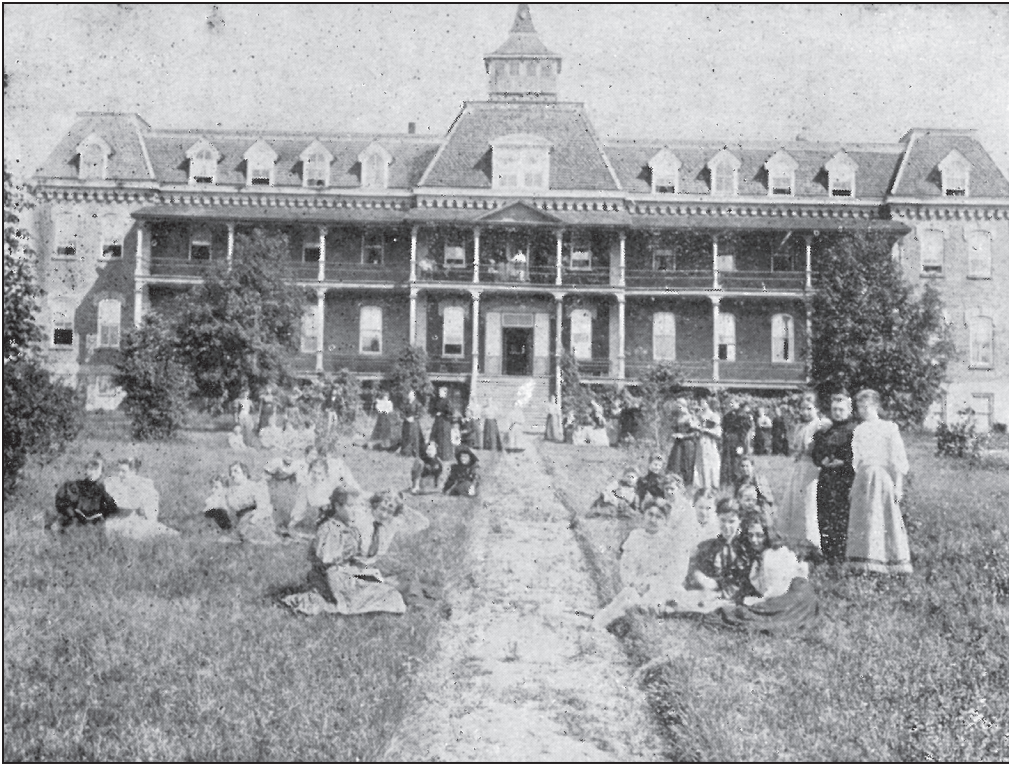
Demill Ladies' College in Oshawa, during its heyday.