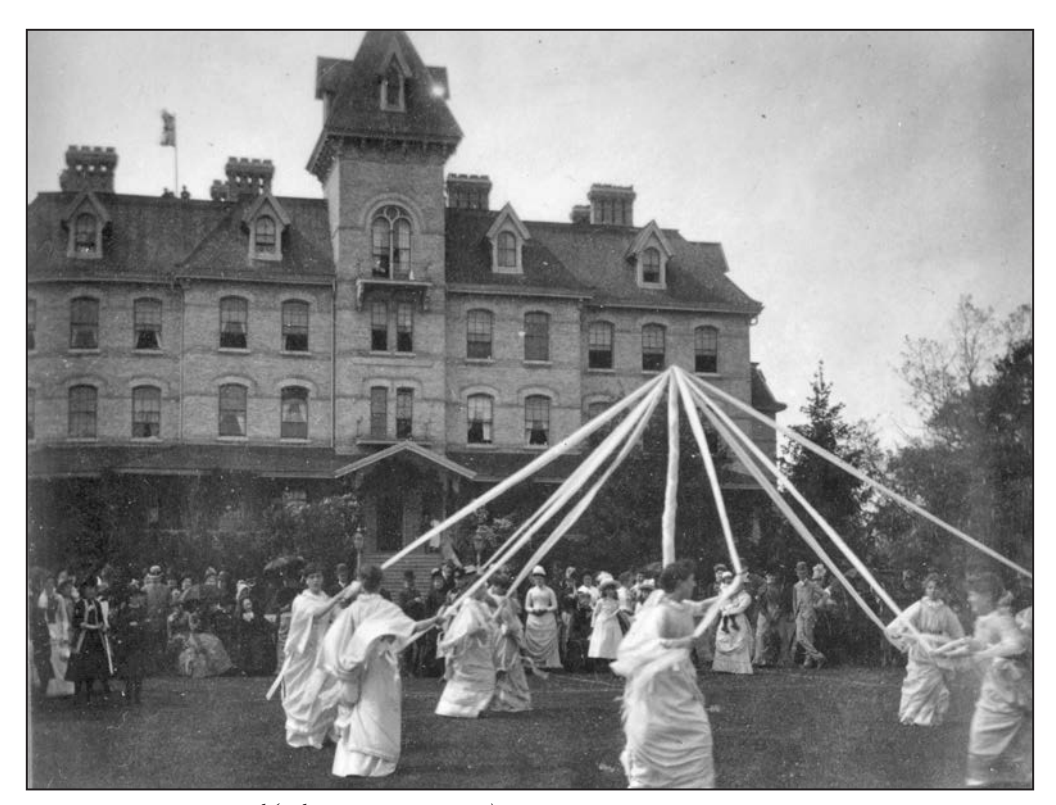
Figure 7: May Day Festival (Julian Seavey, c.1884-5)

their erect carriages, severe hairstyles and control of the horse. The visual juxtaposition is most marked in the pairs of figures at either end of the frame: on the far left the white dress of the girl holding the bridle shines against the trees and dark skirt of the mounted rider behind her, and on the right the masculine-style headgear of the mounted rider is sharply delineated in the centre of the negative space of the sky. The two groups have an uneasy relationship—will the three mounted girls climb down and join their fellow rider in the centre of the frame? The profile of a