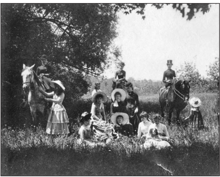
Figure 6: Pastoral Scene (Julian Seavey, c.1884-5)