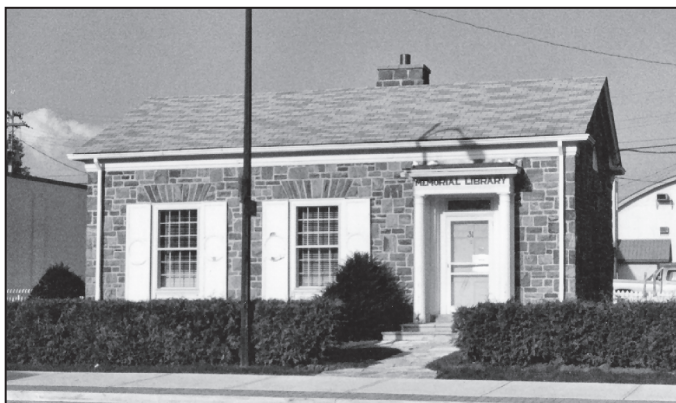
Fig. 2 Colwater Public Library, 1980