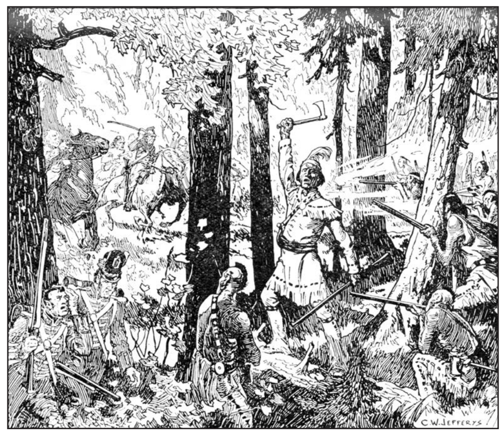
Tecumseh at the Battle of the Thames, , 1813, by C.W. Jefferys.

because America was the aggressor. He has been declared against us; we have wrote in August of 1812, "All defensive wars are just. We were at peace and war