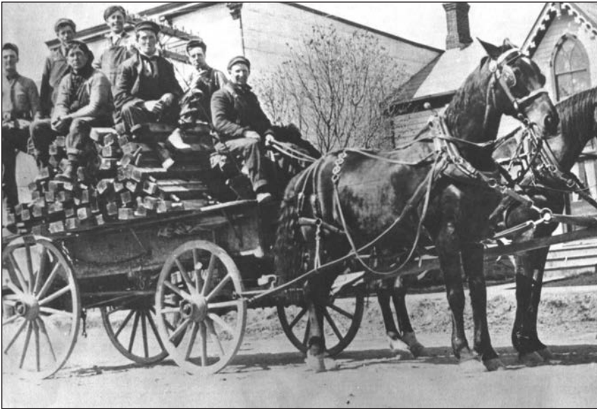
Linesman taking a wagon of crossarms to repair telephone lines. 989.21.3

related to the running of a rural telephone company. Financial records are the most prominent items in these fonds—stock records of shareholders, receipt and cash books, notices to creditors, tax information—but other textual documents also