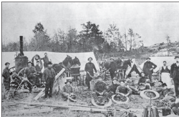
The construction of the line connecting Owen Sound to Meaford, 1886, 990.5.12

with their services were Woodford Telephone Co., Silcote Telephone Co. and Sydenham Union Telephone Co., all independent companies which like Centre Road Telephone Co. provided service to a set of residents considered too remote to be serviced by Bell. City lines had the luxury of being private lines, but, at the time, all rural telephone lines were party lines, with up to fifteen households sharing a single wire. For Centre Road Telephone Co. there were thirty-two shareholders in their company with seventeen shares each; each original shareholder guaranteed connection to the newly erected telephone lines. When these shares were sold, problems could arise if location of service changed with them, especially considering no money returned to the telephone company. In such cases, it was advisable to provide service at no cost to the new shareholder. The Supervisor of Telephone Systems, James McDonald, addressed Centre Road Telephone Co. on this concern: