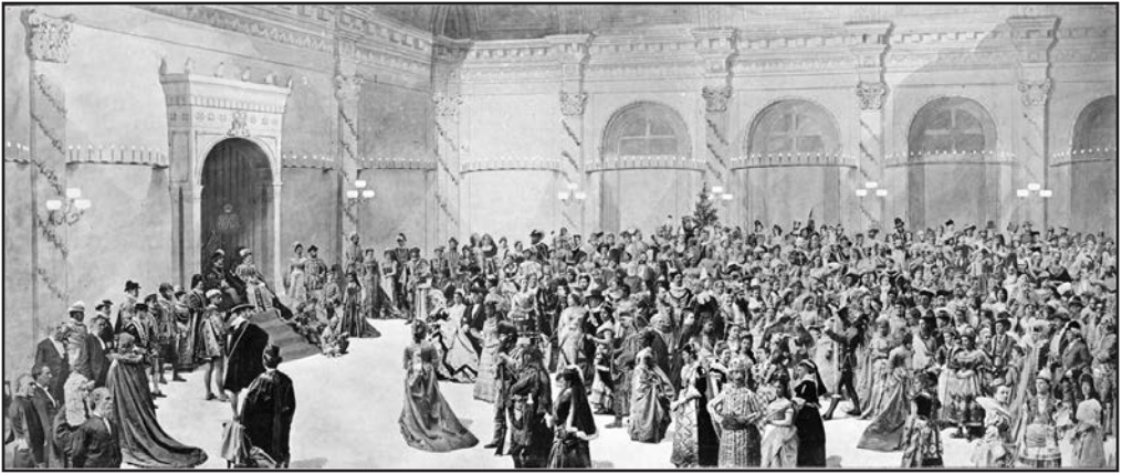
"The Governor-General's Fancy Dress Ball" Canada. Patent and Copyright Office

my departure from Toronto is not what I anticipated." Although she would not miss York itself, she would miss her new friends. 96