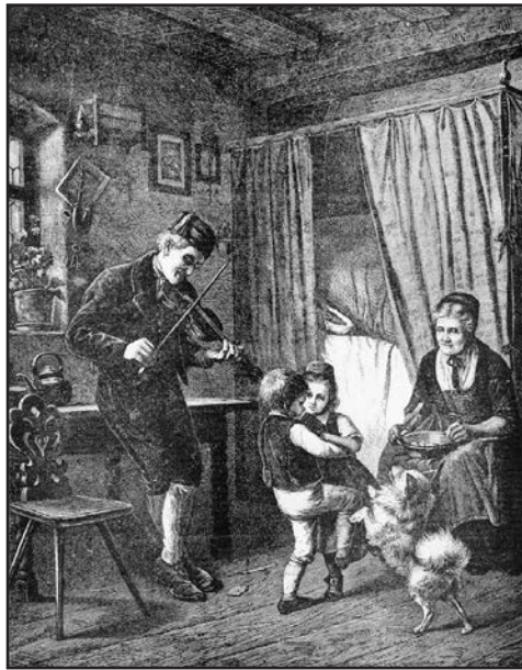
"The First Waltz," The Canadian Illustrated News , 13 August 1870. Library and Archives Canada , C-050359.

and grace—and dress could give—Rank and honourable status to be sure were conspicuous, but all were made perfectly easy and delighted with the soft strains of music—and when the waltzing struck up ... it is not surprising that sober country people" one assumes like himself,