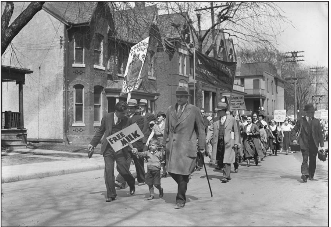
Men, women, and children marching for free milk in Toronto's 1934 May Day parade.

their children could, thus, be seen as an extension of traditional maternal femininity. These women were not challenging gender conventions, but rather asserting their roles as mothers and the primary purchasers in the household.