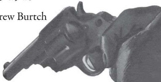
Illustration from Inside Detective magazine, Nov. 1937.