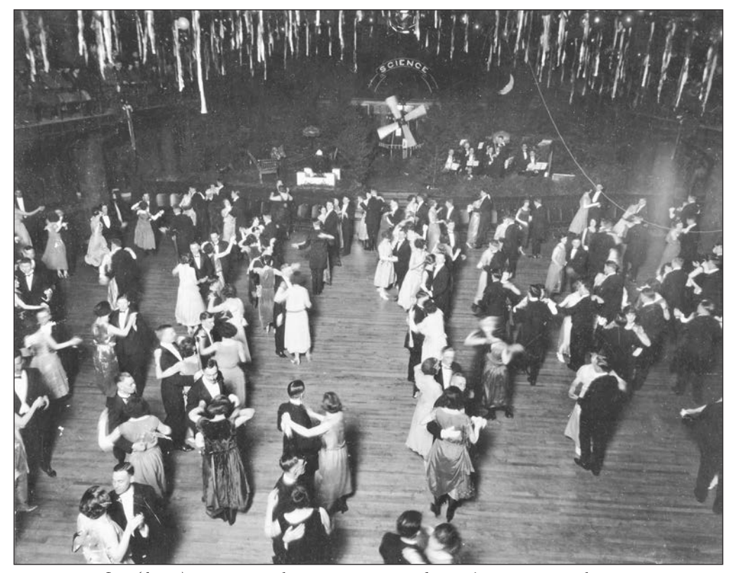
Science Overflow (dance) sometime in the 1920s.

ing to Jazz music was the most popular recreational activity among youth.<sup>30</sup> Jazz, born in New Orleans at the turn of the century, arrived in Canada on the vaude-ville circuit in the mid-to late 1910s and gained popularity through radio and dance halls.<sup>31</sup> The popularity of dancing among young people attracted much controversy due to the close contact between men and women. The dance hall was an opportunity for youthful experi-