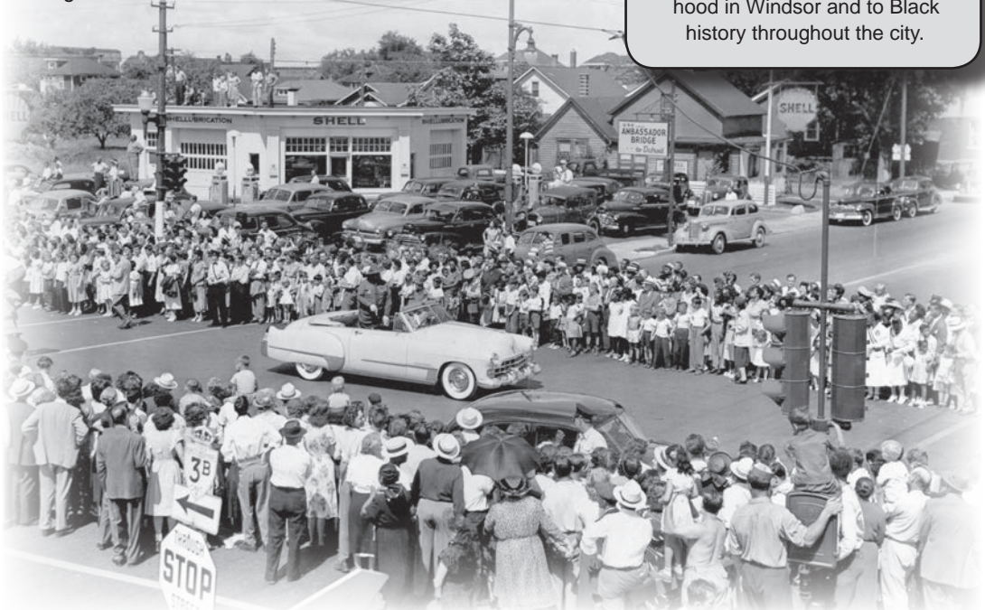
Emancipation Celebration Parade on Ouellette Avenue at Giles Boulevard, Windsor, c.1950.

Records relating to the residents, past and present, of the McDougall Street Corridor Neighbourhood in Windsor and to Black history throughout the city.